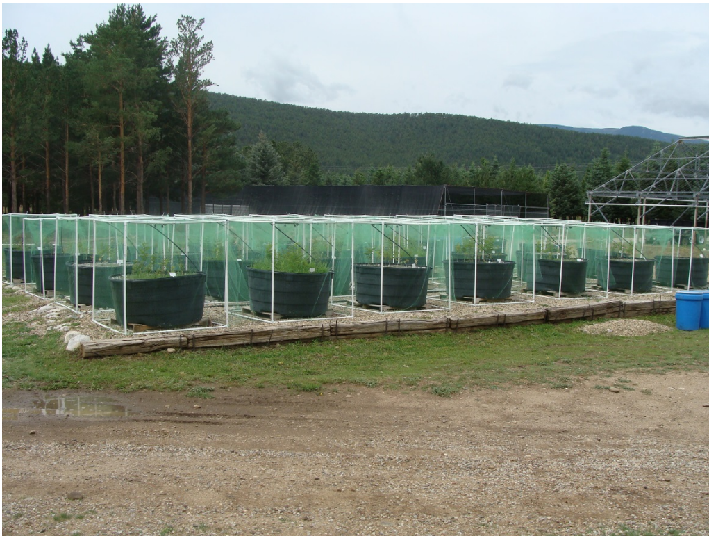
Greenhouse study in progress for the Questa Mine, Taos County, NM

In an effort to allow mining operations the opportunity to utilize atypical reclamation materials when suitable topsoil is unavailable, MARP has often allowed and encouraged operators to employ innovative experiments to demonstrate that these materials are capable of promoting vegetative growth that will develop into a self-sustaining ecosystem. At the Questa Mine during 2014, MMD collaborated with and authorized CMI to perform a greenhouse study using Spring Gulch waste rock material as a potential growth media in order to evaluate plant growth, plant uptake of molybdenum, and direct toxicity to plants. Spring Gulch waste rock is stockpiled mine overburden and is comprised primarily of mixtures of two rock types: aplite and andesite.