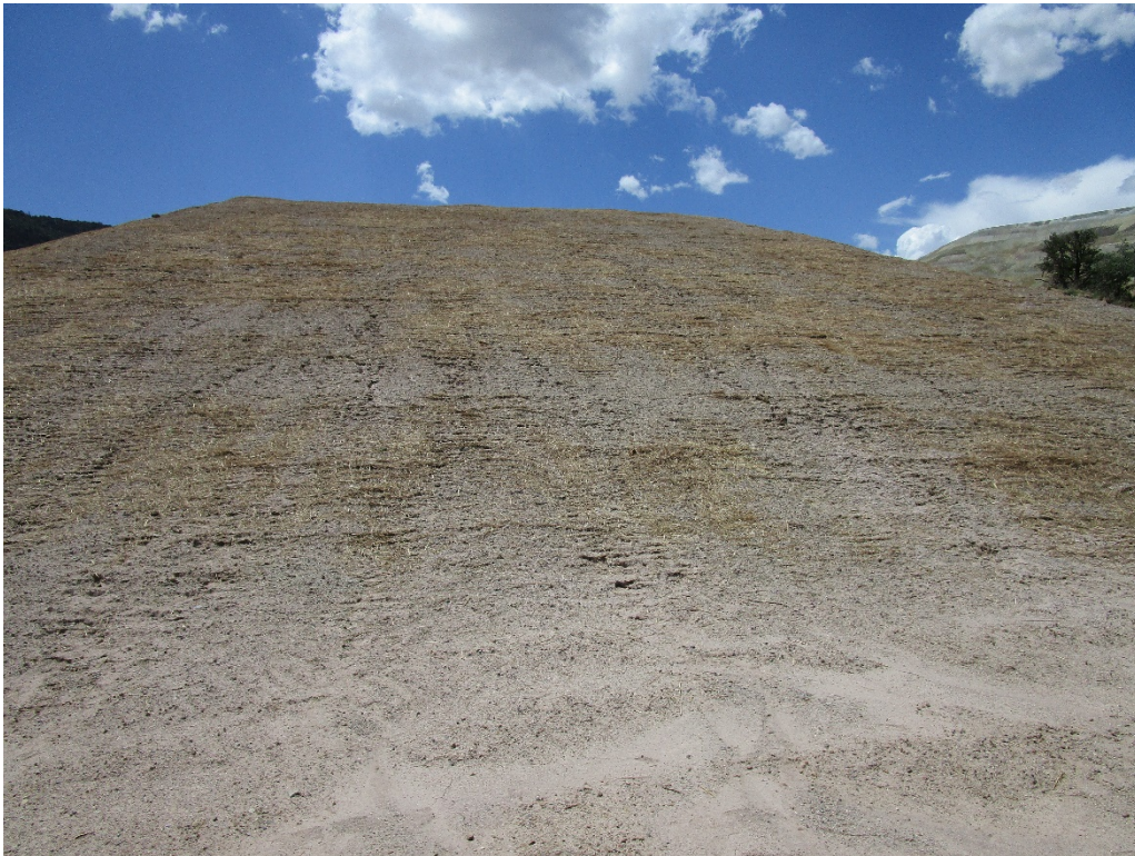
3H:1V Rubio Peak Formation test plot after construction

In 2018, Chino Mines Company initiated construction of a reclamation test plot composed of Rubio Peak Formation materials with the intent to demonstrate that this material is suitable for eventual large-scale reclamation of the Chino mine. Two test plots were constructed: a 3H:1V test plot to simulate outslope reclamation and a near-flat test plot to simulate top surface reclamation. Each test plot utilized a minimum of 3-feet of Rubio Peak Formation excavated from a nearby borrow source. The test plots were mulched and seeded in June 2018. Chino Mines Company and MMD will continue to evaluate the test plot performance over the next several years.