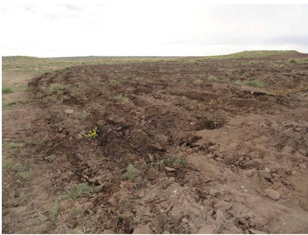
Deeply ripped mine reclamation in sandy, poorly developed soils

In high desert environments with low precipitation and poor soil conditions, such as in portions of McKinley County where humate mining is abundant, MMD has encouraged operators to employ low cost land reclamation techniques in an attempt to maximize reclamation success. One of the methods employed recently in McKinley County that has shown some success is deep-ripping. Ripping breaks apart the compacted layers after backfilling, which is especially important when the surface has become crusted and difficult to penetrate. Ripping is performed along the contour of any slopes and is performed to a depth of between 2-3 feet. Reseeding is performed immediately after ripping.