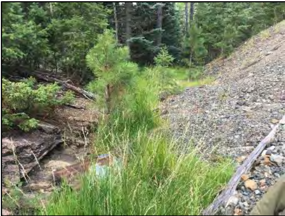
Photograph D.10. Downstream view of the ephemeral drainage adjacent to an old mine adit, facing southwest.