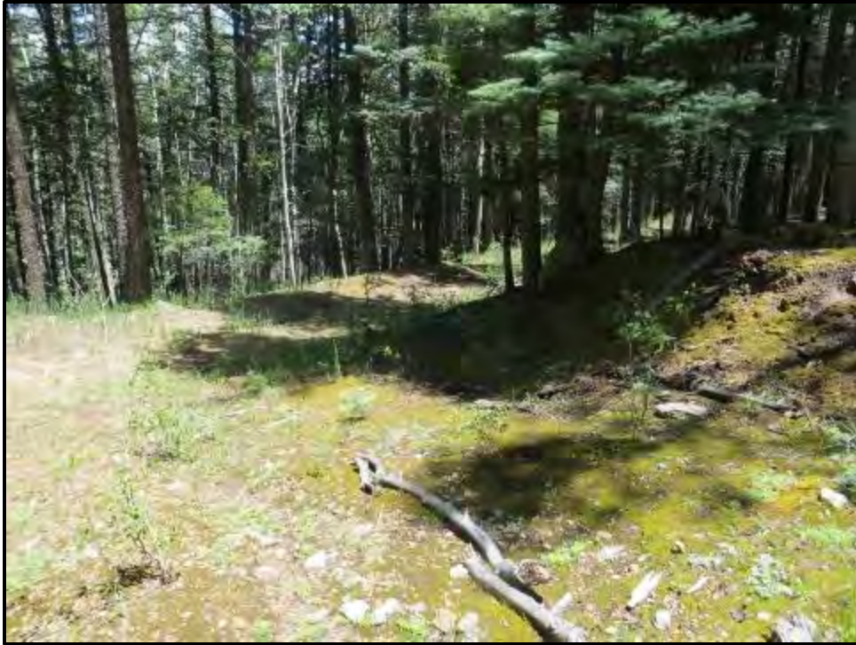
Photograph D.3. View of drill site in the eastern part of the project area, facing east.