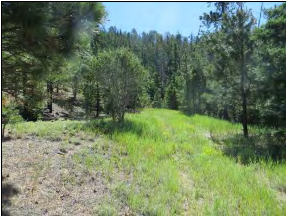
Photograph D.2. View of drill site in the western part of the project area, facing east.