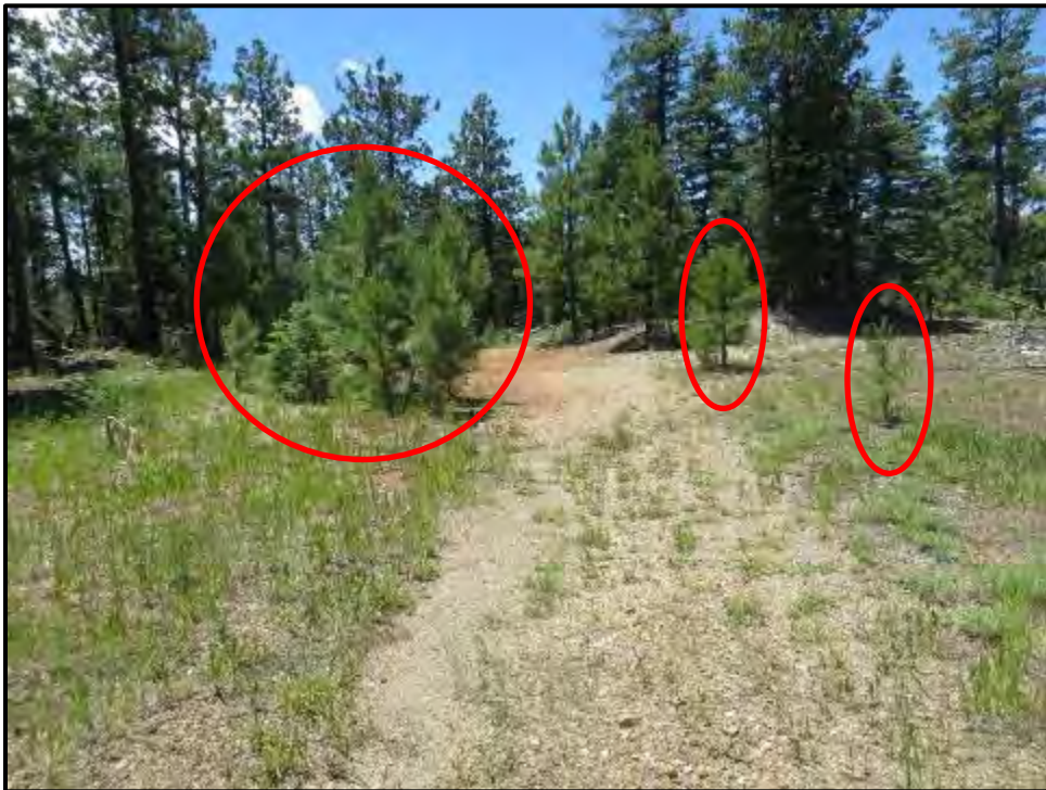
Photograph D.4. View of drill site in the central part of the project area, facing south. The red circles indicate potential seedlings/saplings for removal to accommodate drill sites for the proposed action.