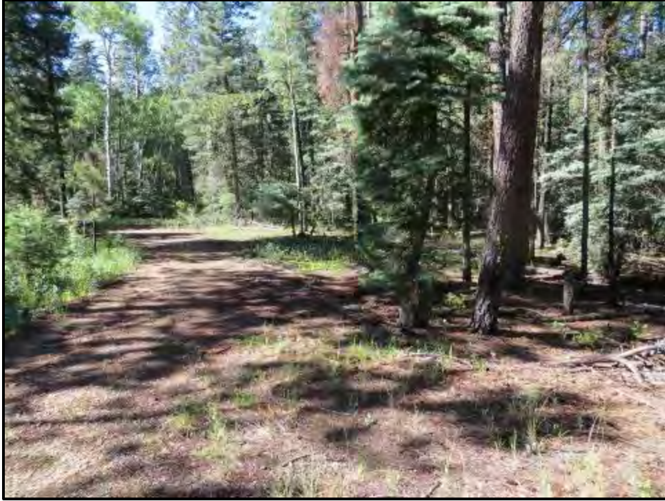
Photograph D.1. View of drill site in the southern part of the project area, facing south.