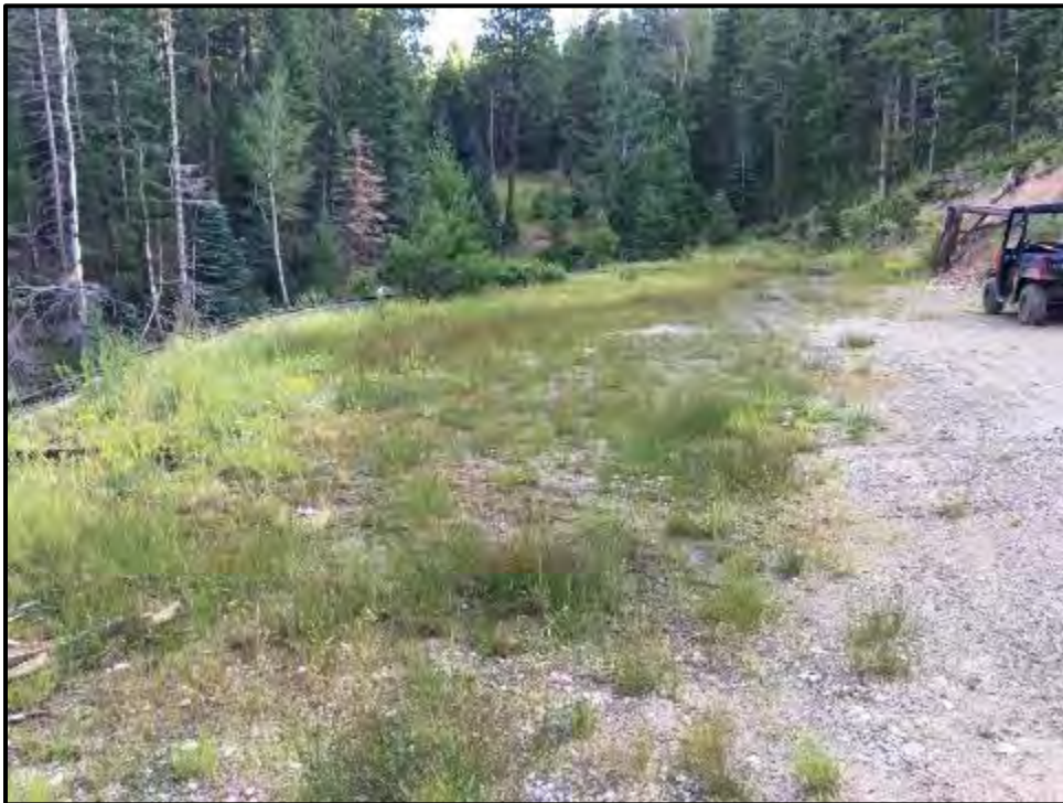
Photograph D.8. View of a seasonally wet area adjacent to an old mine adit, facing north.