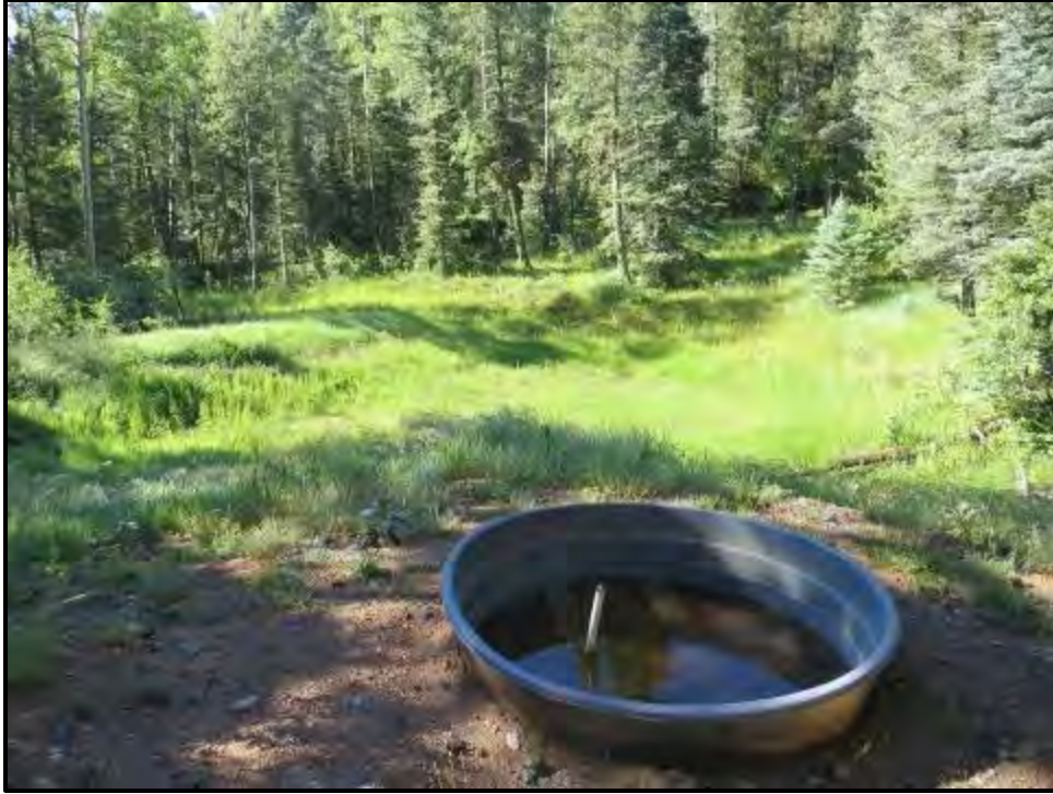
Photograph D.7. View of a seasonally wet area within the staging area in the southeast corner of the project area.