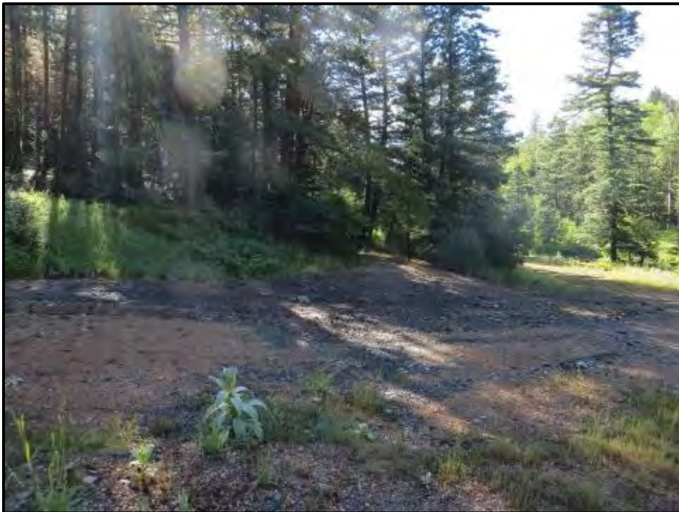
Photograph D.6. View of the staging area. Note the plastic trough (just outside the project area) in the background, view facing southeast.