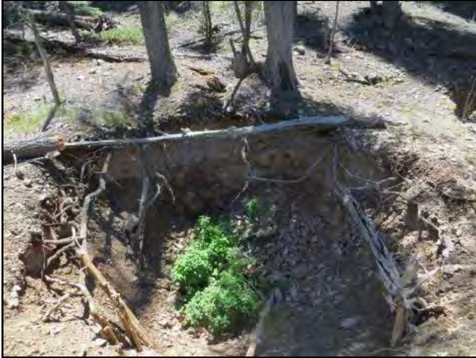
Photograph D.5. View of drill site in the northern part of the project area, facing south.