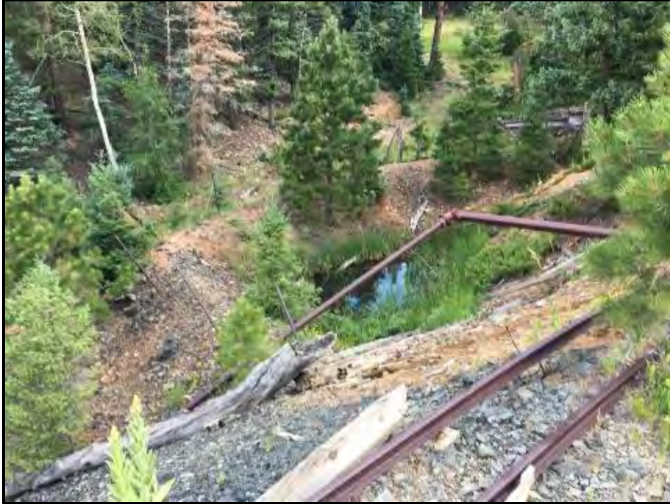
Photograph D.9. View of the small pond adjacent to the old mine shaft. Groundwater comes to the surface along the hillside, view facing northwest.