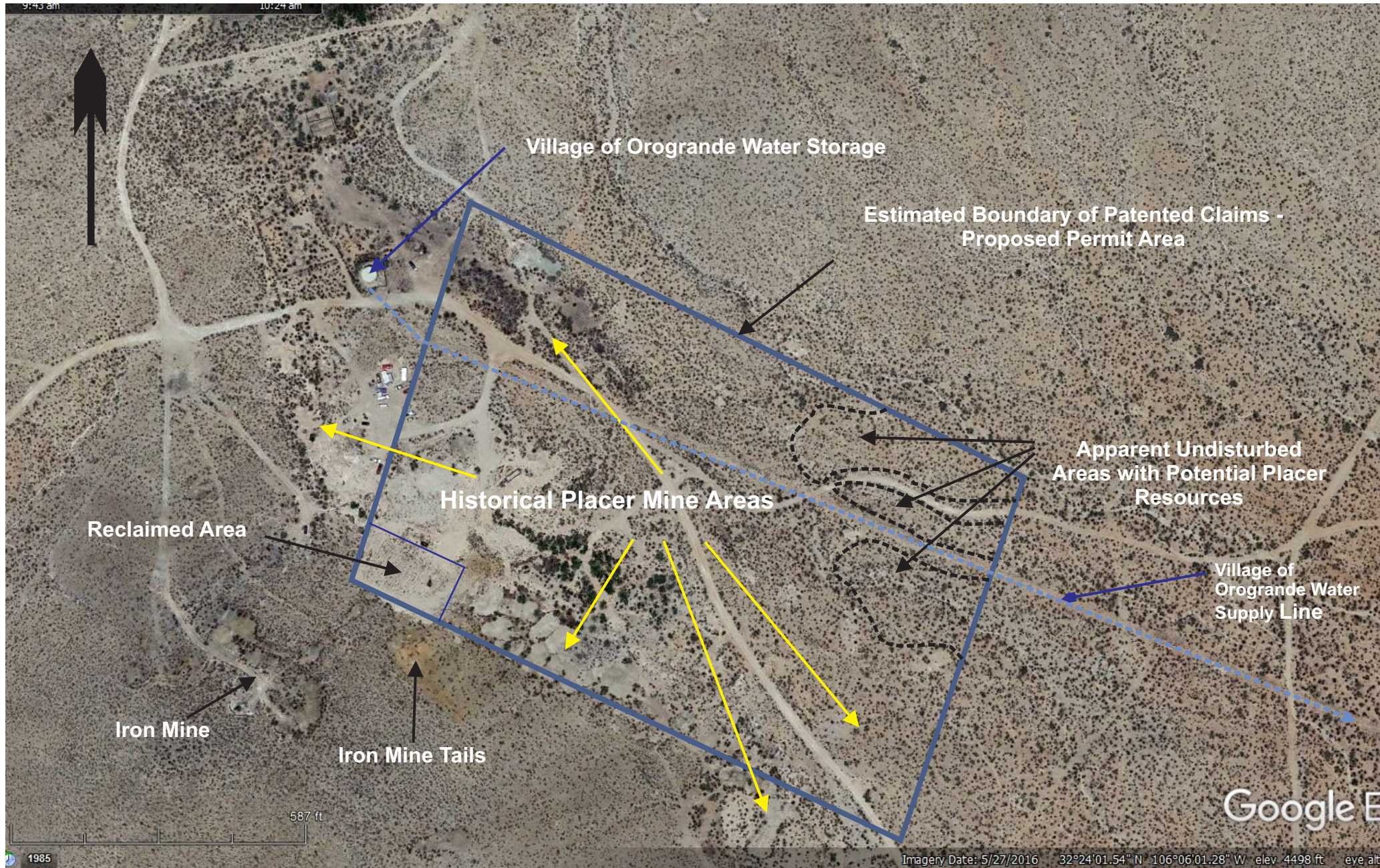
Figure 1. Map of proposed Permit Area - Orogrande Gold Placer Minimal Impact Mining Operation OT005MN