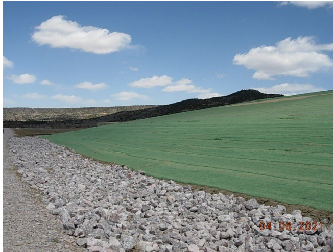
Erosion blanket installed at the Mt. Taylor Mine.

The use of erosion blankets is a common reclamation practice used at mine sites, and was implemented on the South Waste Rock Pile at the Mt. Taylor Mine. Erosion blankets are often temporarily placed on reclaimed slopes to prevent erosion before a cover material is placed on top. The use of erosion blankets holds soil and waste materials in place until an evapotranspiration cover or other suitable growth media is placed on top as a more permanent reclamation solution.