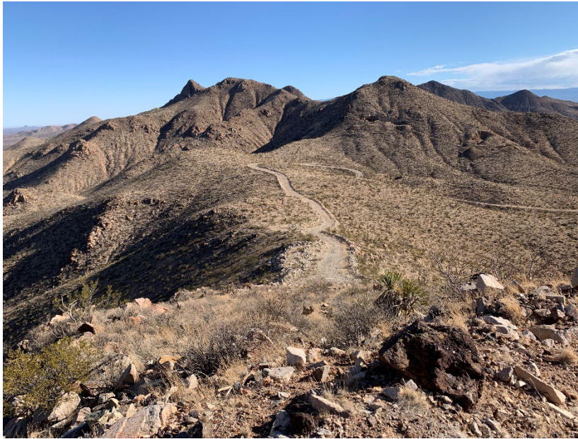
FIGURE 7 LOOKING DOWN AT THE LONGER ROAD (NNE DIRECTION)