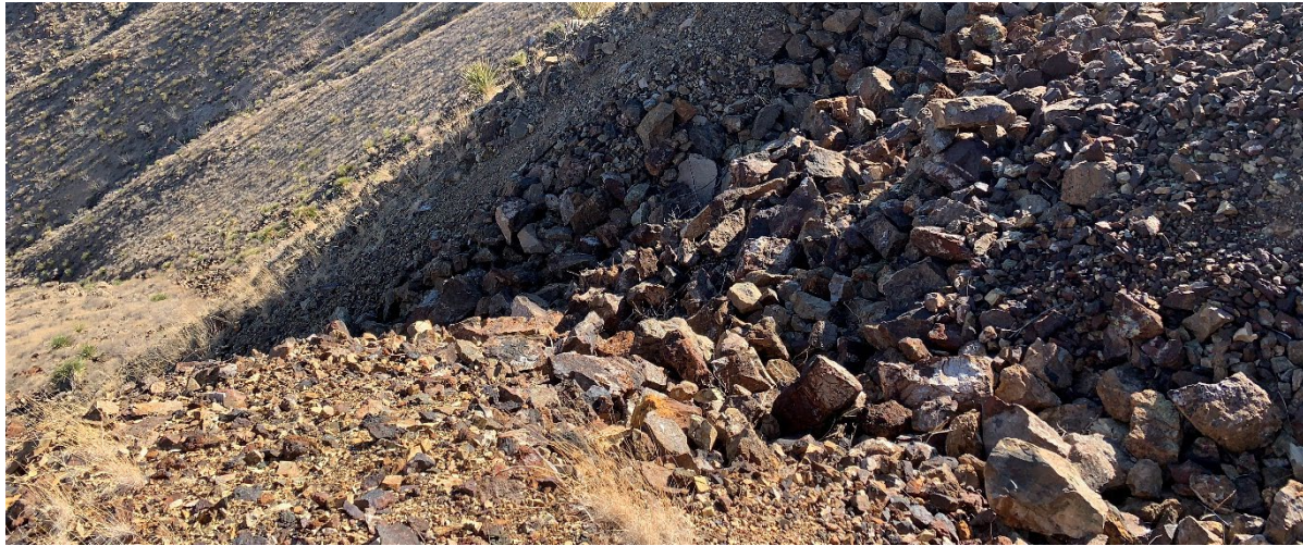
FIGURE 12 DRAINAGE OFF THE ROAD