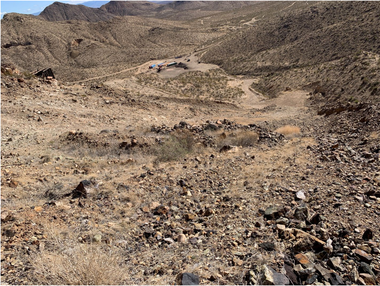
FIGURE 16 ROAD LOOKING NE