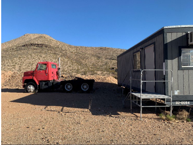
FIGURE 1 TRAILER AND TRUCK

The front gate has a small trailer, which was vandalized as well as a truck in disrepair. Near the truck was what appeared to be fresh dirt on a stockpile.