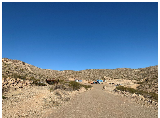
FIGURE 4 LOOKING INTO PROCESSING AREA (WEST)