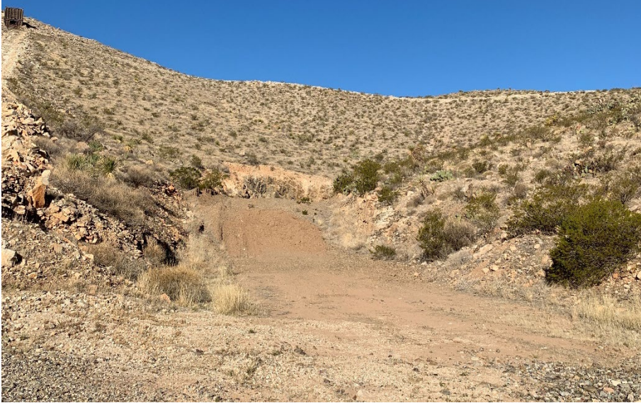
FIGURE 5 LOWER DISTURBED EXPLORATION AREA