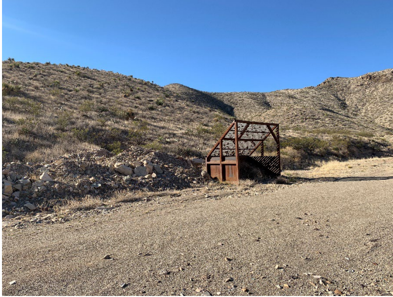
FIGURE 3 SIEVE IN THE MINE PROCESSING AREA