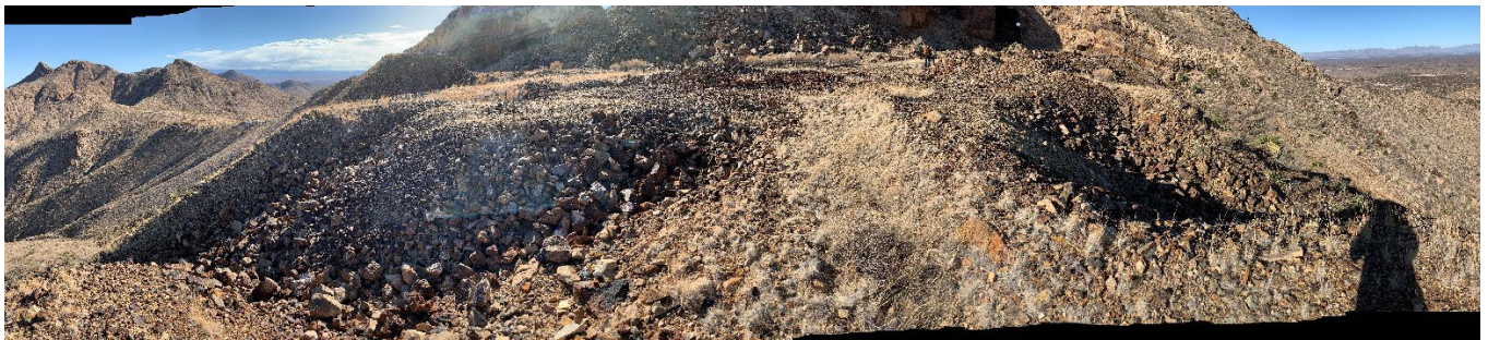
FIGURE 13 PANORAMA OF DISTURBANCE LOOKING SOUTH