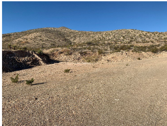
FIGURE 3 STOCKPILE AT ENTRANCE ON THE LEFT/SOUTH SIDE