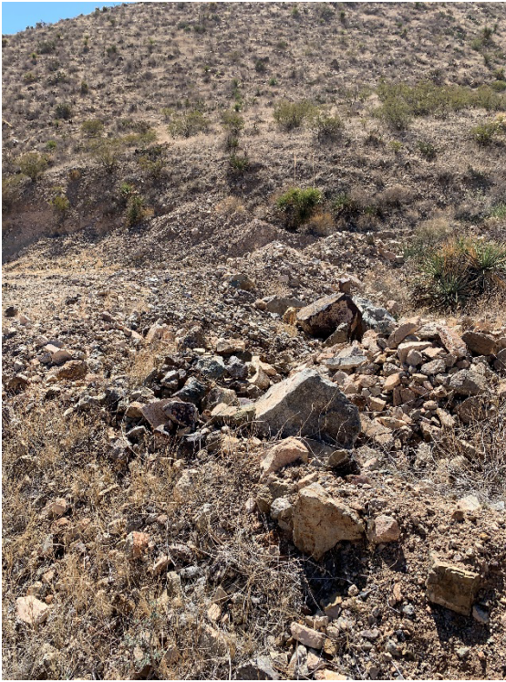
FIGURE 19 TOP OF THE STOCKPILE