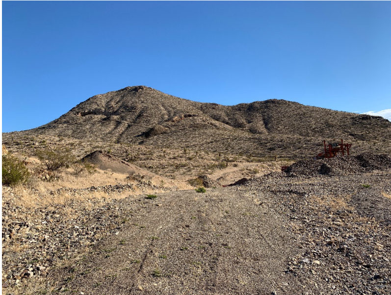
FIGURE 4 LOOKING EAST DOWN THE ROAD