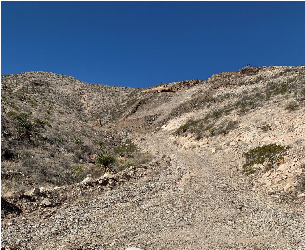
FIGURE 20 LOOKING UP UNRECLAIMED ROAD AT THE STOCKPILE