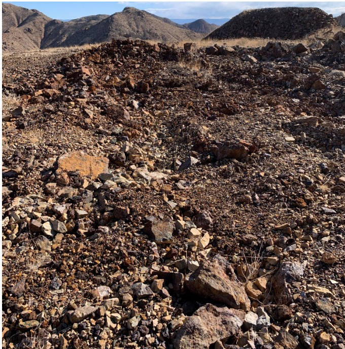
FIGURE 11 ROCKS APPEARING TO HAVE BEEN MOVED WITH MACHINES