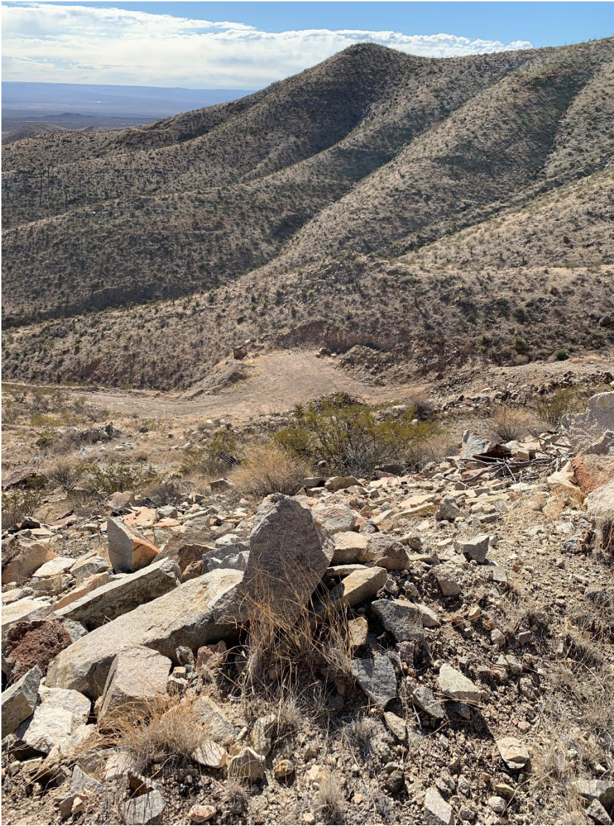
FIGURE 14 LOOKNG DUE EAST TO THE ROAD