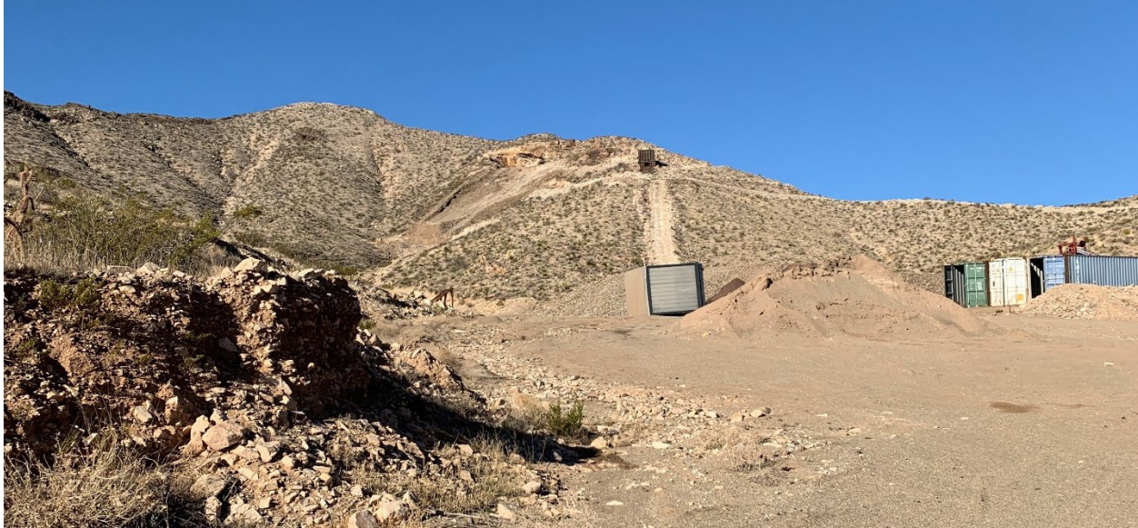
FIGURE 1 LOOKING UP TO THE HIGHWALL/MINING AREA (WEST)