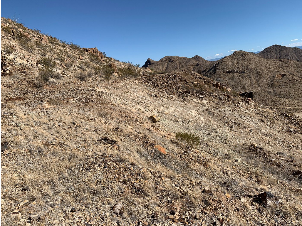
FIGURE 17 LOOKING ACROSS STOCKPILE; NEWER DISTURBANCE