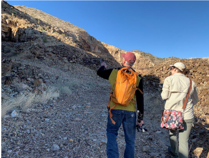
FIGURE 9 LOOKING AT BACKSIDE OF HIGHWALL CUT