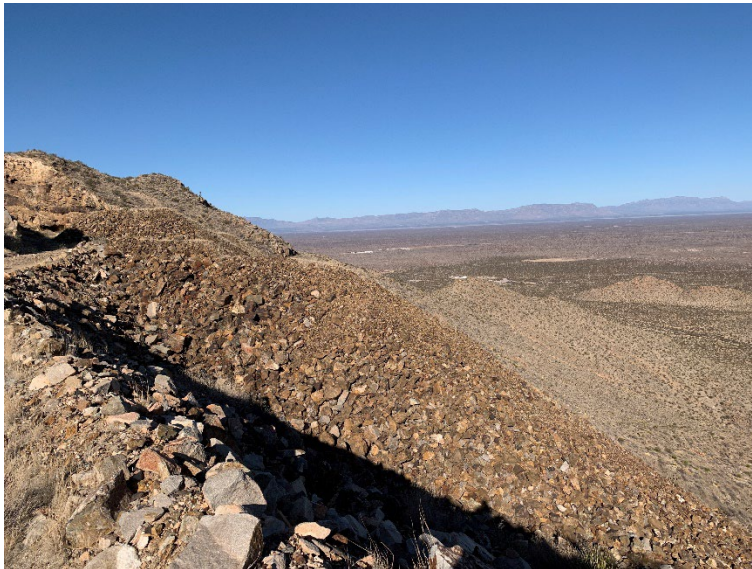
FIGURE 8 LOOK NORTH WEST OFF THE ROAD