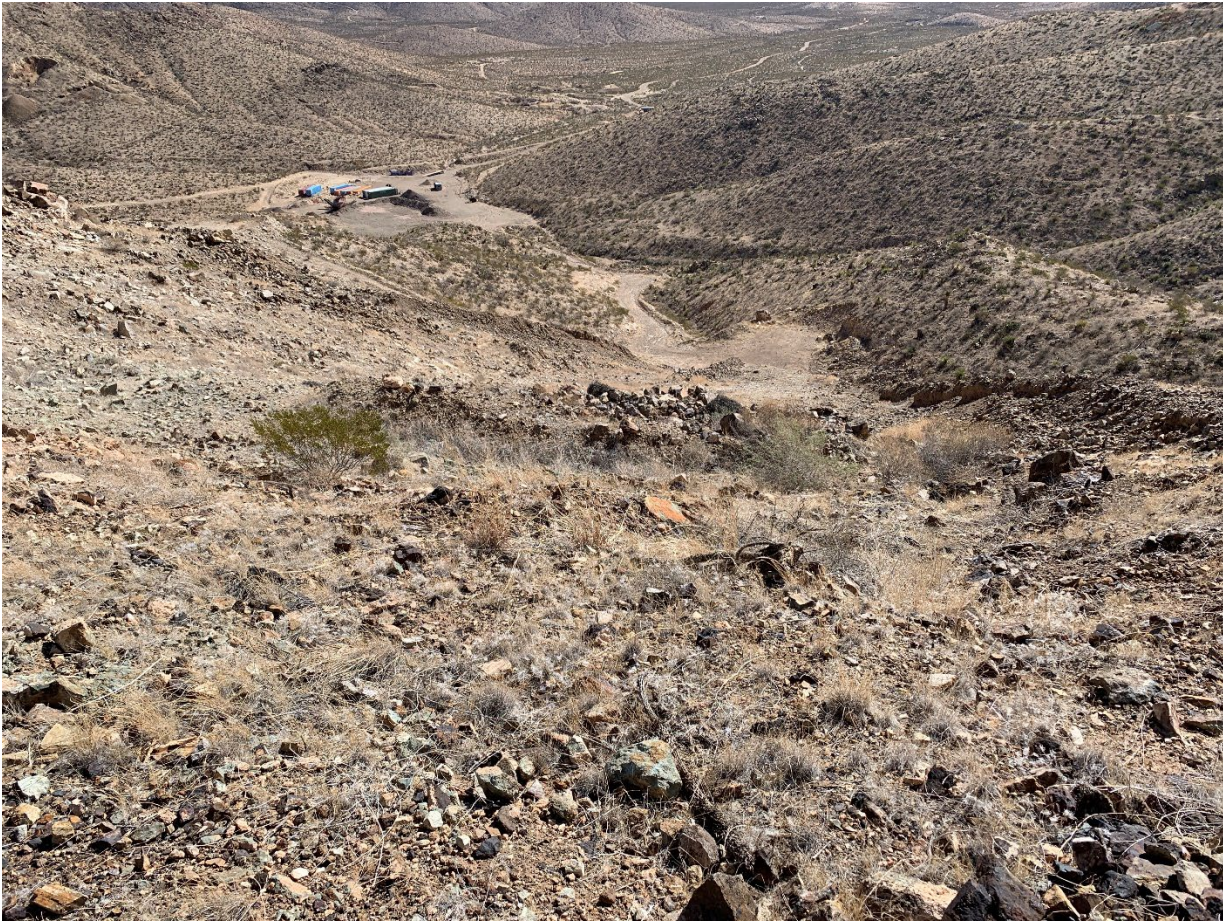
FIGURE 15 LOOKING EAST DOWN THE ROAD.