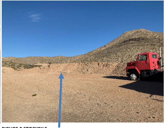
FIGURE 2 STOCKPILE