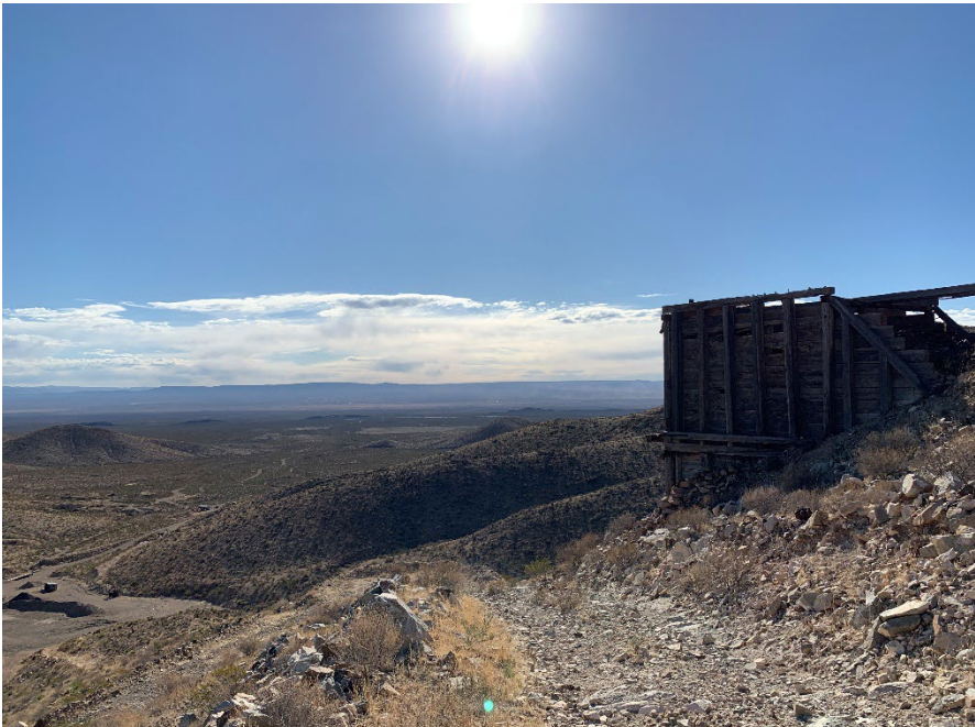
FIGURE 6 LOOKING DOWN THE ROAD FROM HISTORIC MINING FEATURE (EAST)