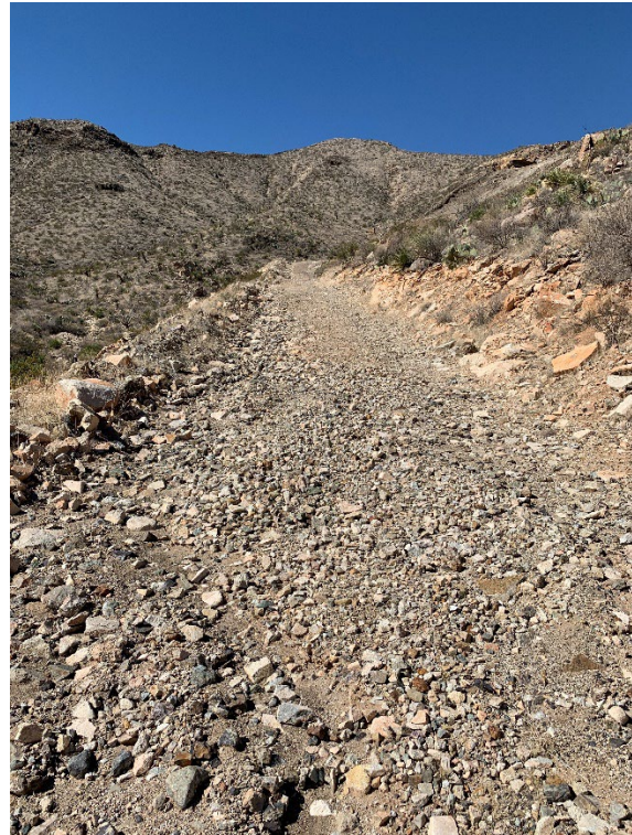
FIGURE 18 LOOKING UP THE UN-RECLAIMED ROAD