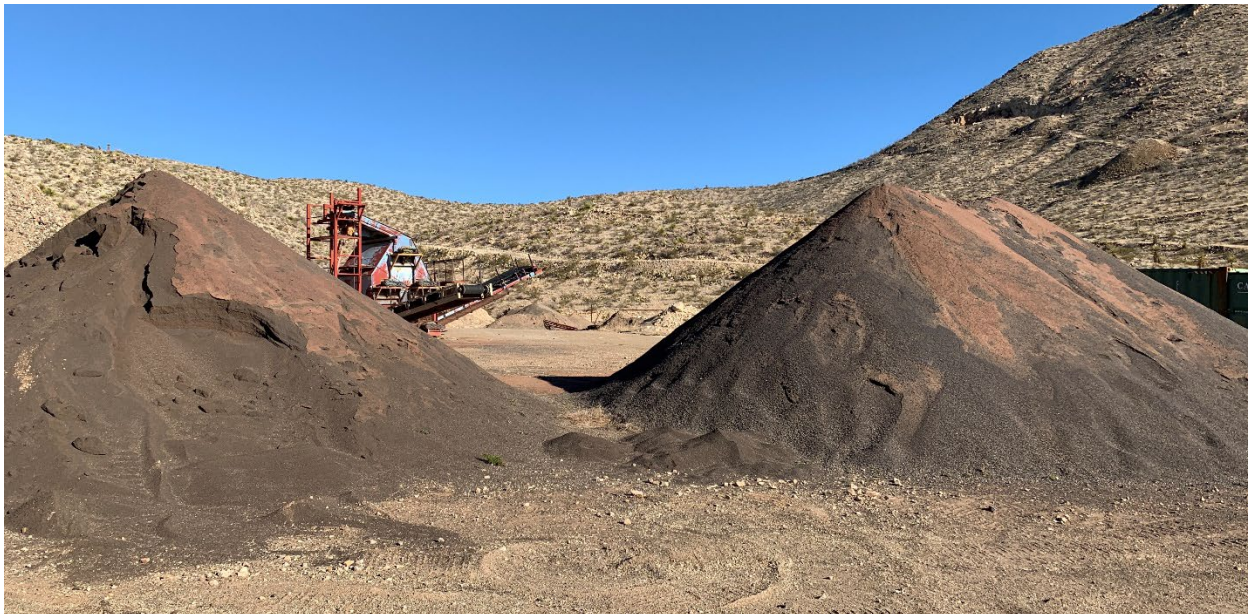
FIGURE 2 STOCK PILES IN MINE PROCESSING AREA