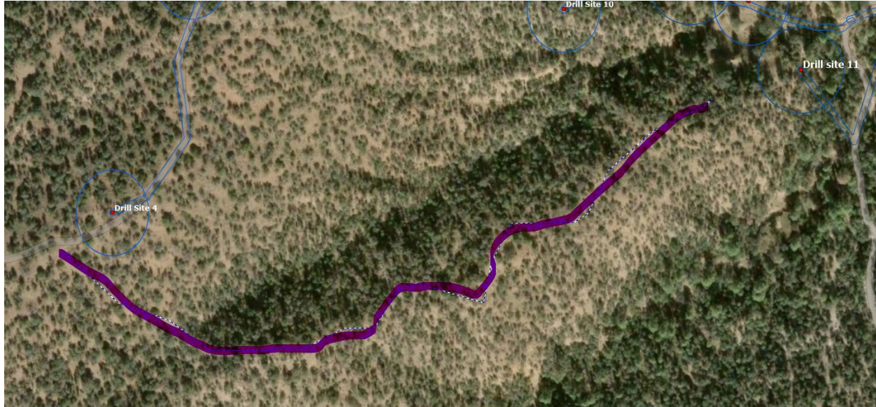
Figure 2 Purple Line marking tracks of unauthorized road

Use of unapproved access routes is concerning because: