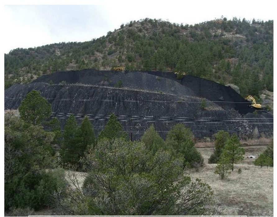
Coal Gob Reclamation near Raton