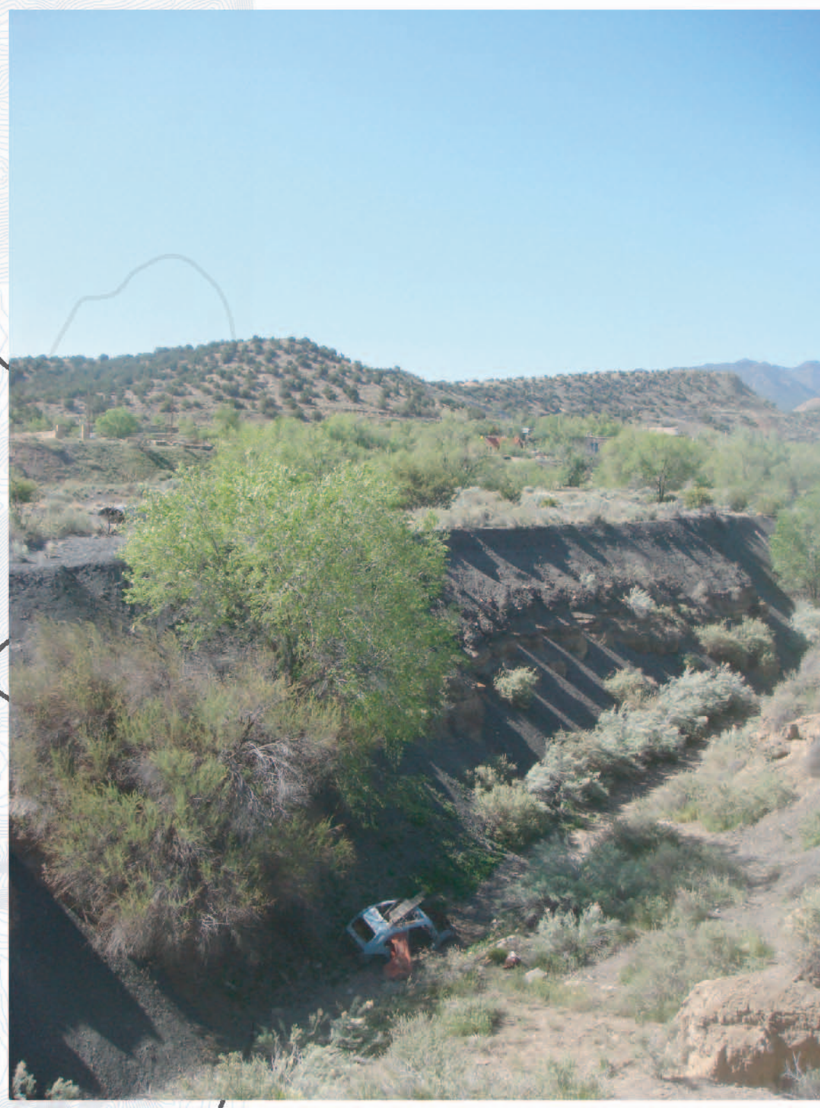
DEEPLY INCISED MADRID ARROYO