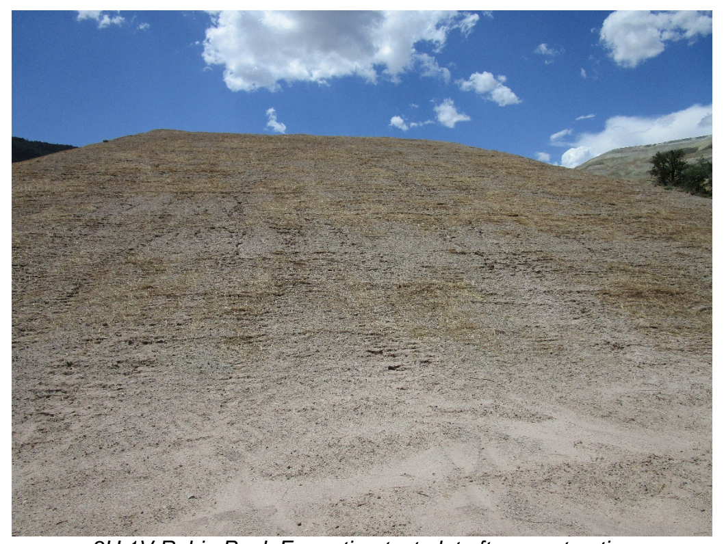
3H:1V Rubio Peak Formation test plot after construction

In 2018, Chino Mines Company initiated construction of a reclamation test plot composed of Rubio Peak Formation materials with the intent to demonstrate that this material is suitable for eventual large-scale reclamation of the Chino mine. Two test plots were constructed: a 3H:1V test plot to simulate outslope reclamation and a near-flat test plot to simulate top surface reclamation. Each test plot utilized a minimum of 3-feet of Rubio Peak Formation excavated from a nearby borrow source. The test plots were mulched and seeded in June 2018. Chino Mines Company and MMD will continue to evaluate the test plot performance over the next several years.