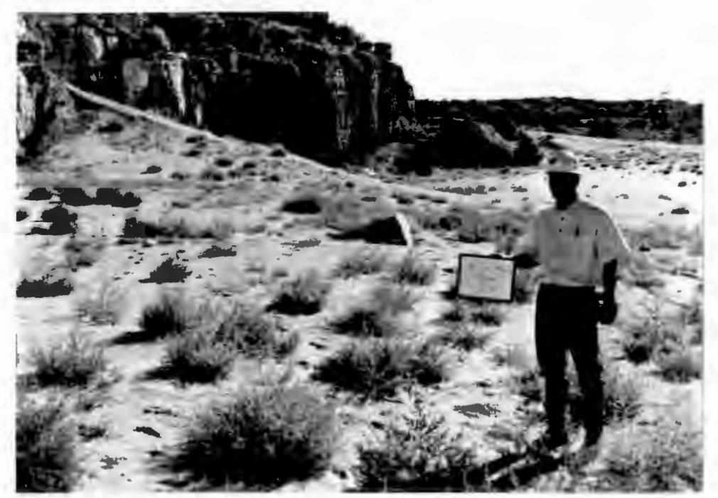
Marquez Mine, Reclaimed Declined Shaft, 9/12/95