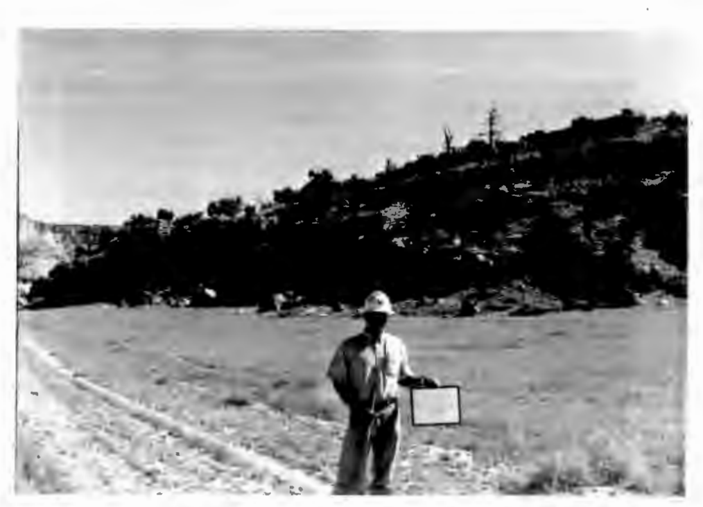
Section 1 T13N R9W, Looking Up at Mine Site, 9/13/95