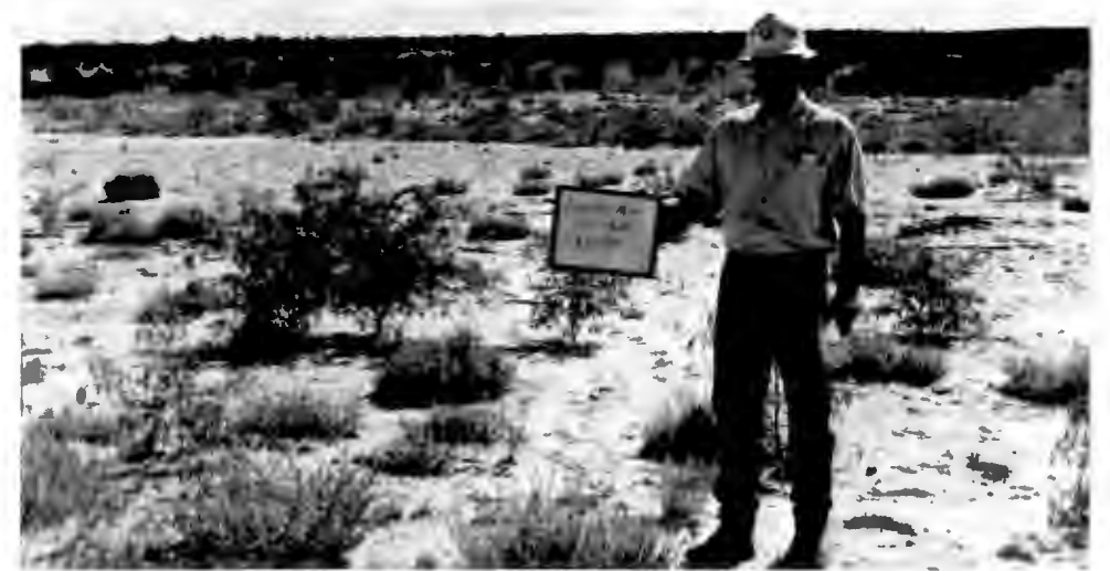
Isabella Mine, From North, 9/12/95