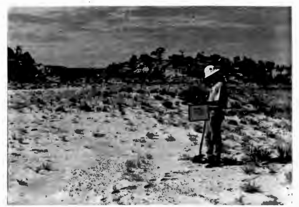
Section 1 T13N R9W, Shaft Site looking South, 9/13/95