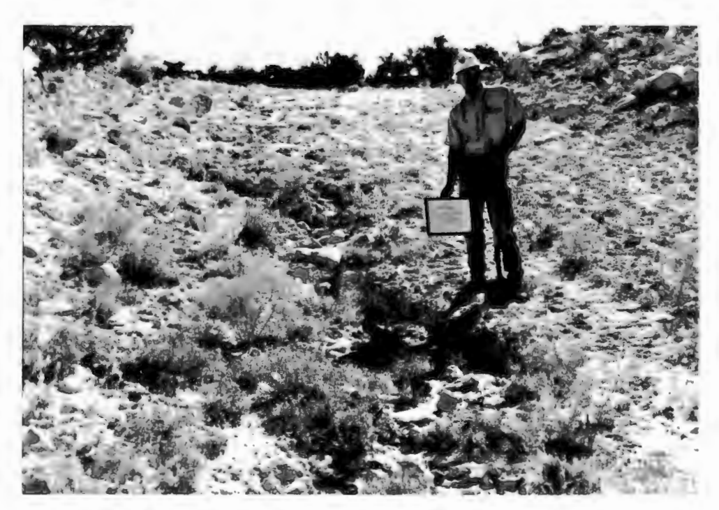
Section 1 T13N R9W, Access Road, 9/13/95