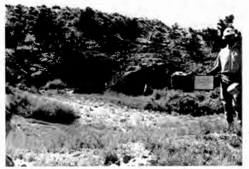
Section 1 T13N R9W, Sediment Pond, 9/13/95