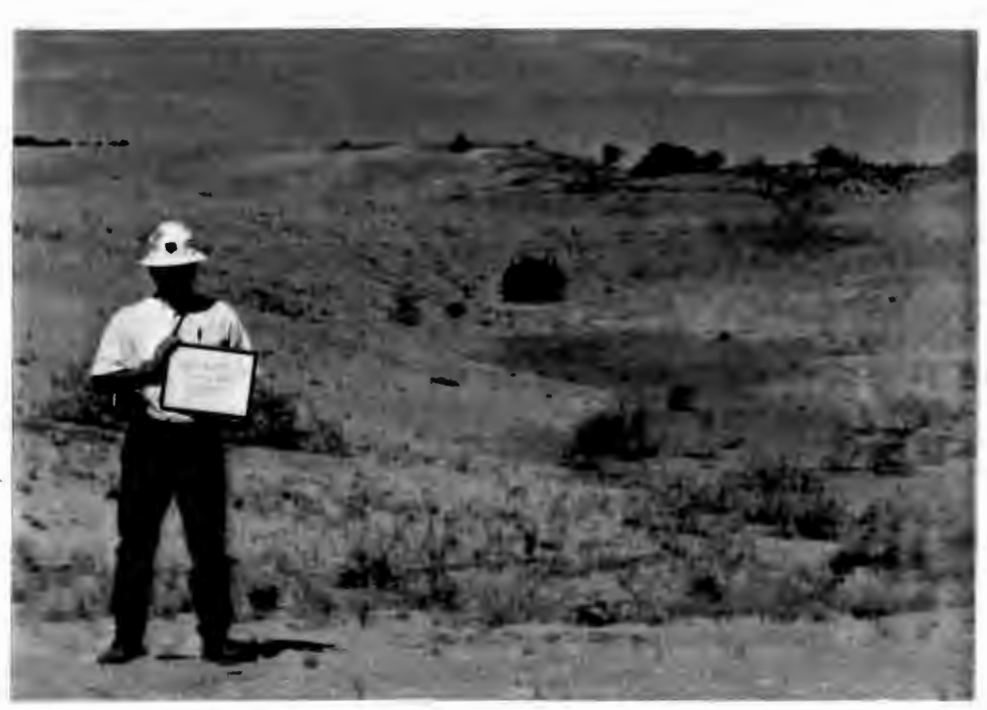
Section 25 Mine, Middle Looking East, 9/12/95