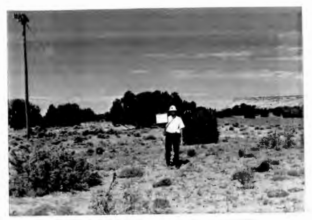
Faith Mine Shaft Site, Looking West, 9/12/95