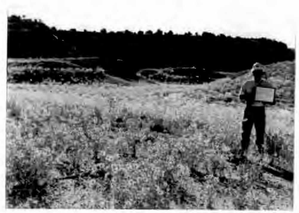
Poison Canyon Mine, Middle Looking East, 9/12/95