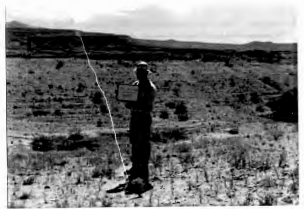
Section 25 Mine, West Side Looking West, 9/12/95