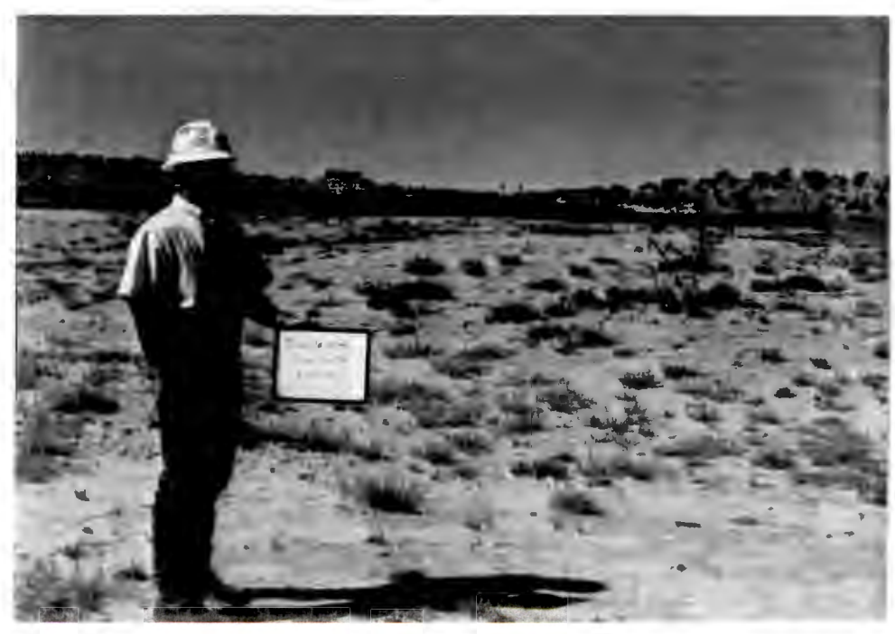
Isabella Mine, From South, 9/12/95