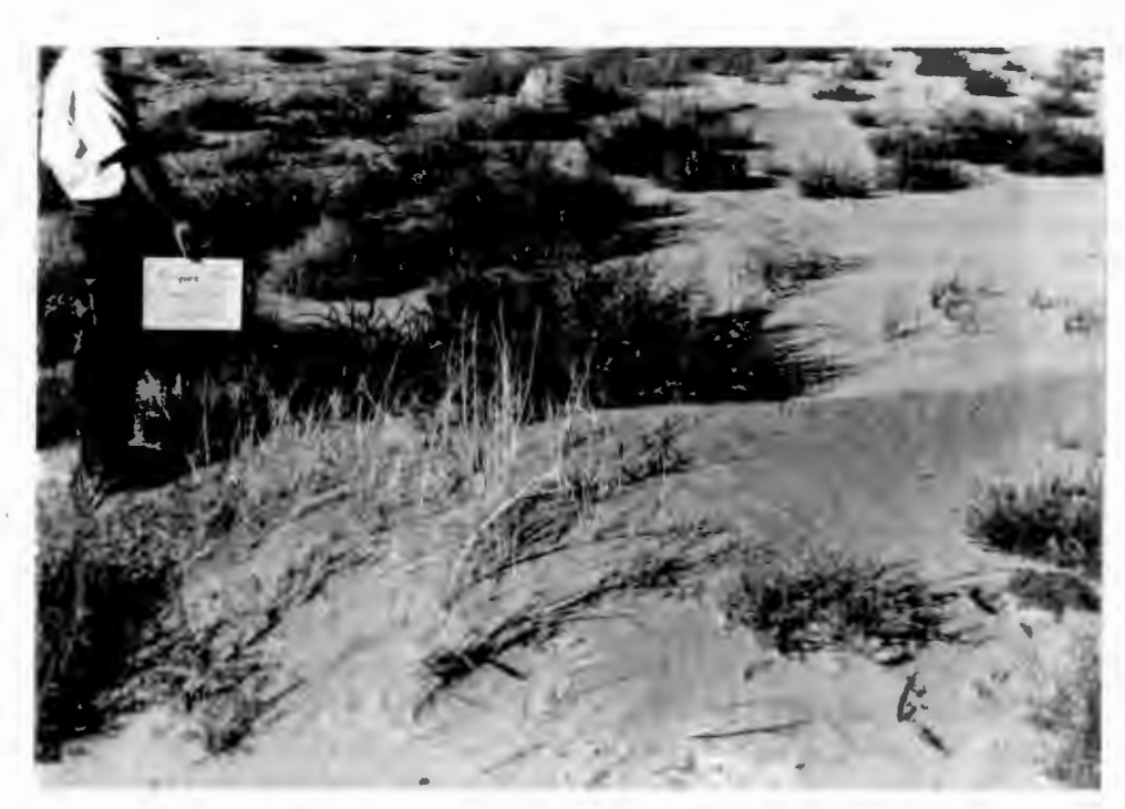
Marquez Mine, Sand Dune, 9/12/95