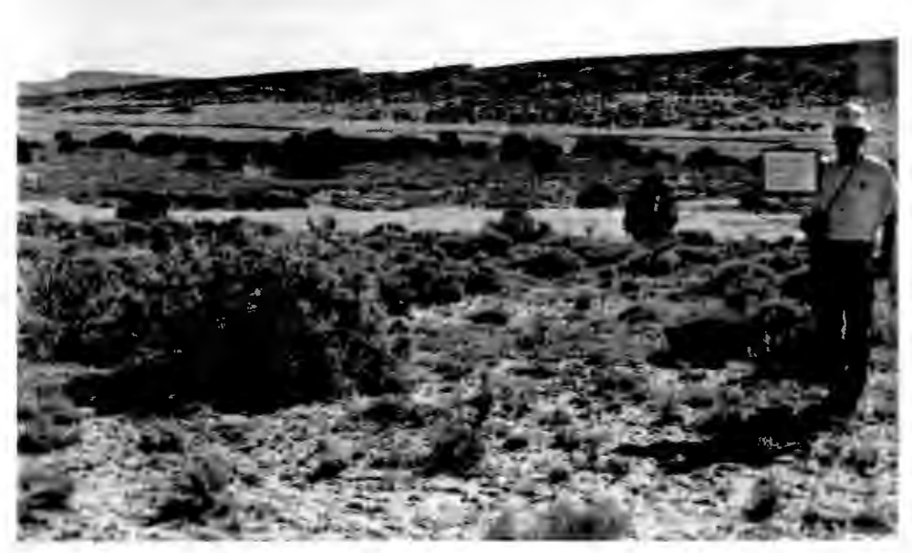
Faith Mine Shaft Site, Looking East, 9/12/95 Regraded Area in Background