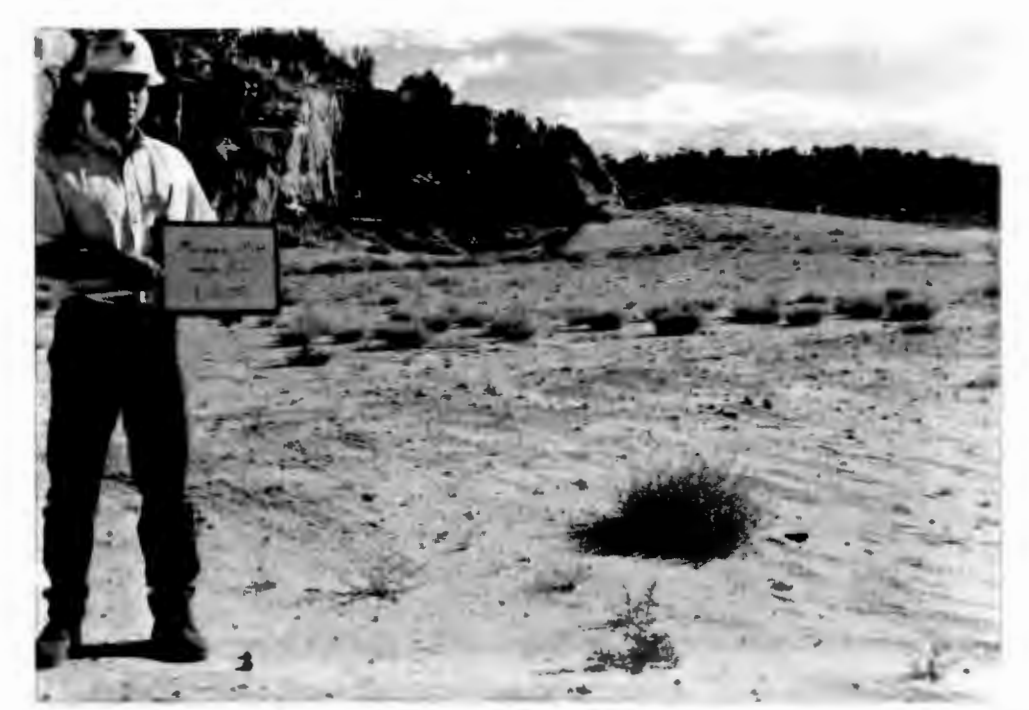
Marquez Mine Waste Pile, 9/12/95