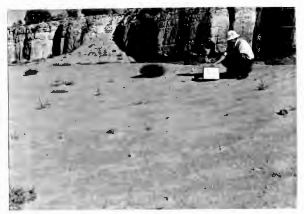
Marquez Mine, Waste Pile, 9/12/95