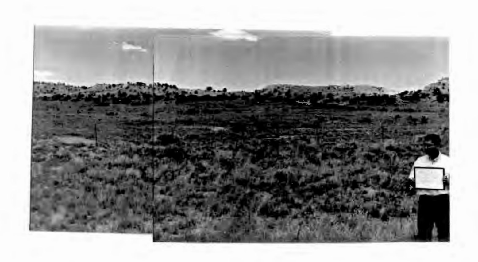
Section 31 T13N R9W, Reconstructed Limestone Bluffs, 9/12/95