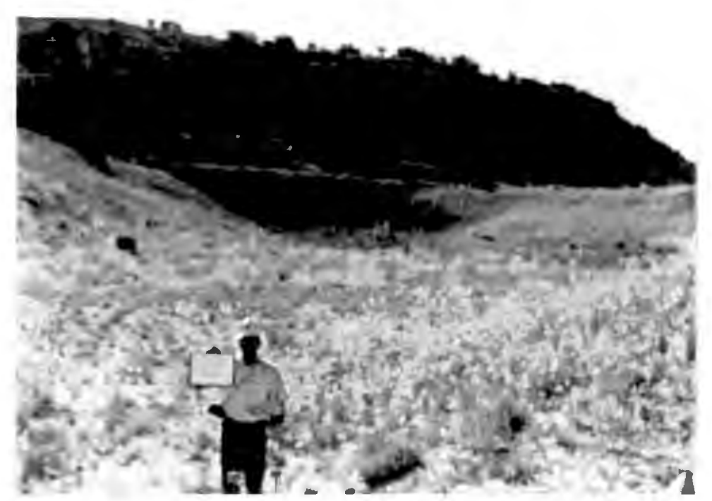
Poison Canyon Mine, Reclaimed Declined Shaft, 9/12/95