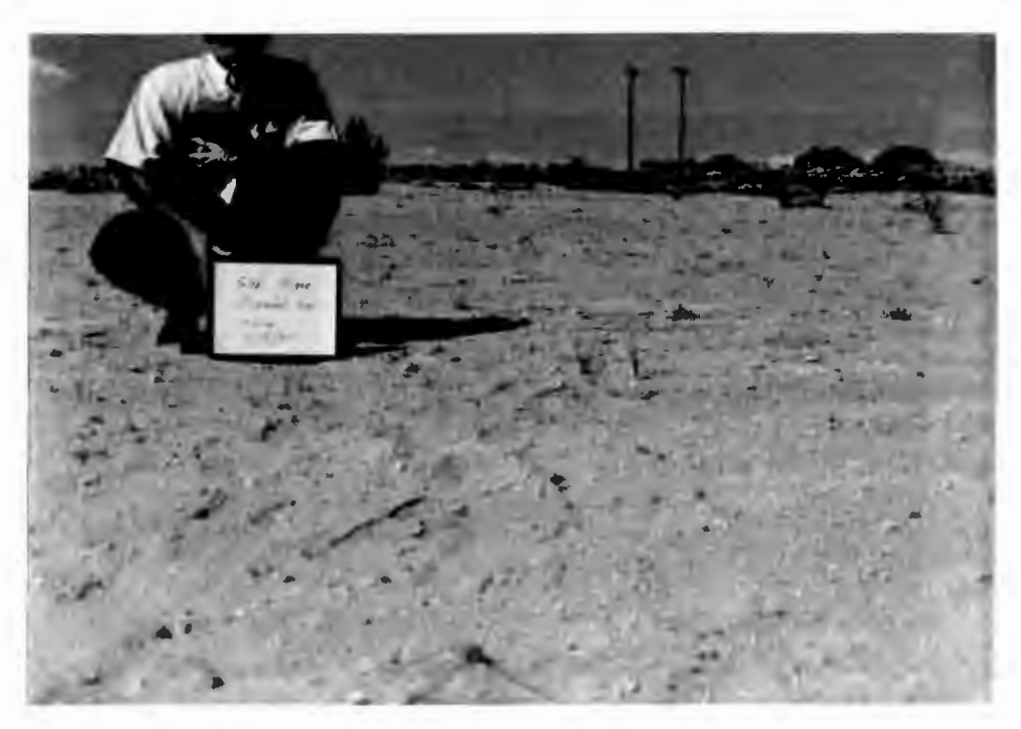
Faith Mine Regraded Area, 9/12/95