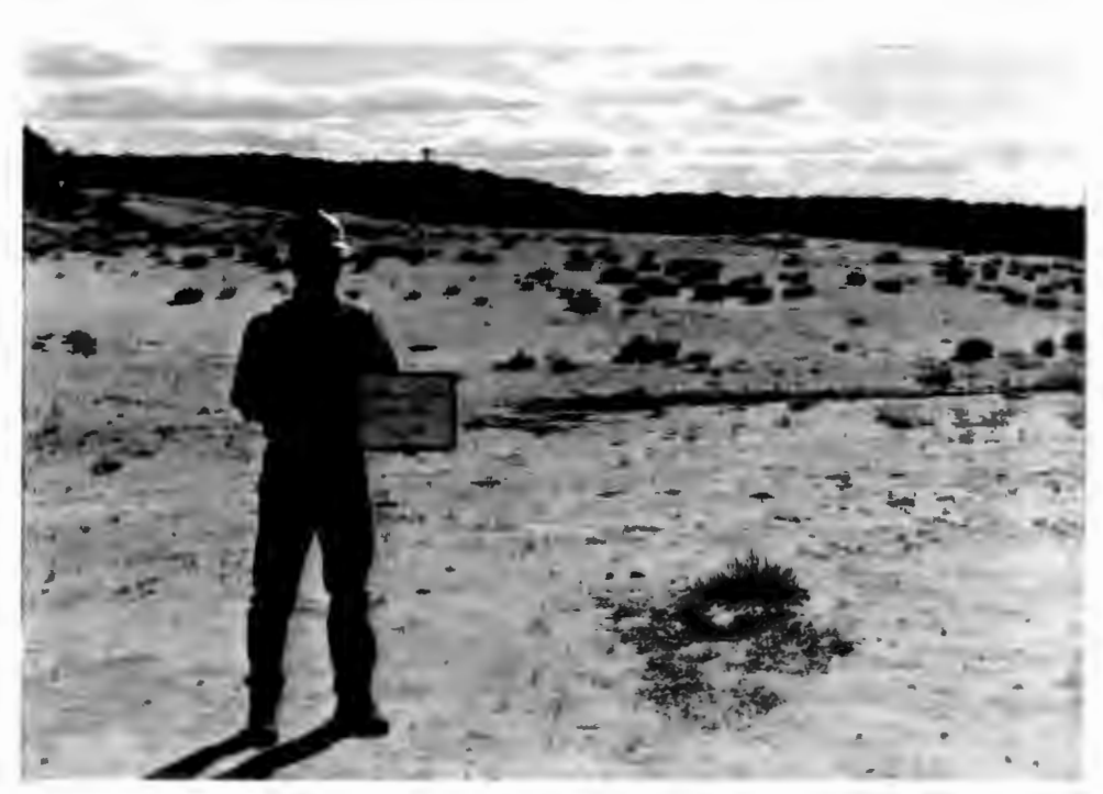
Marquez Mine, Waste Pile, 9/12/95