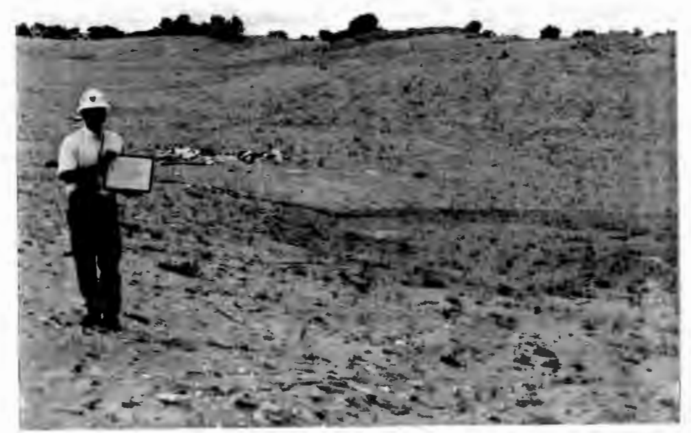
Section 31 T13N R9W, North End Looking South, 9/12/95