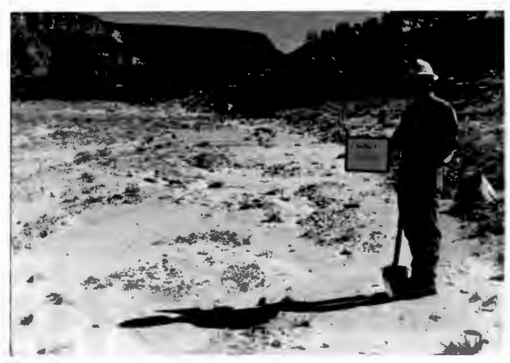
Section 1 T13N R9W, North Side Looking South, 9/13/95