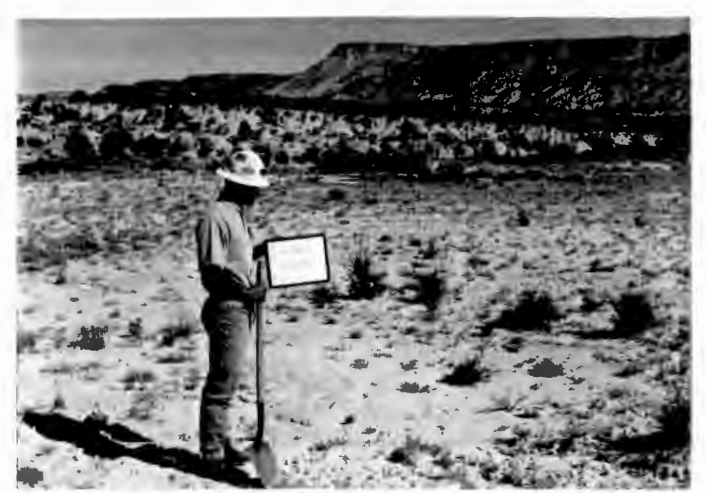
Section 1 T13N R9W, South Side Looking North, 9/13/95