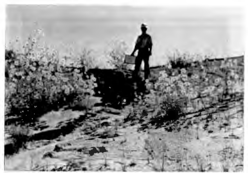
Poison Canyon Mine, Erosion Feature, 9/12/95