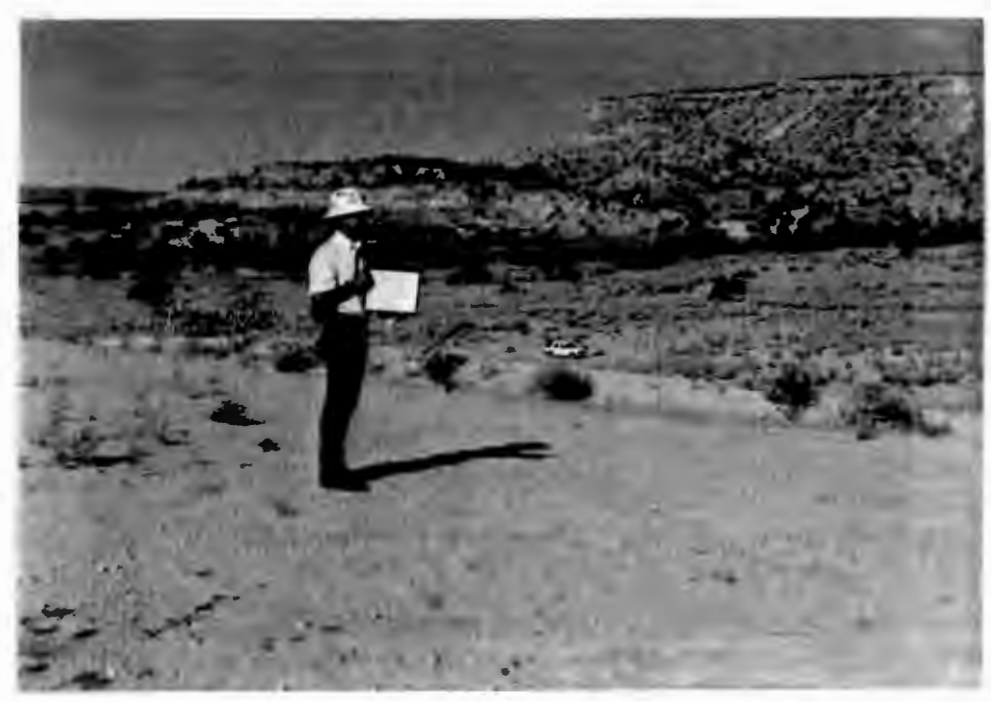
Poison Canyon Mine, Middle Looking West, 9/12/95