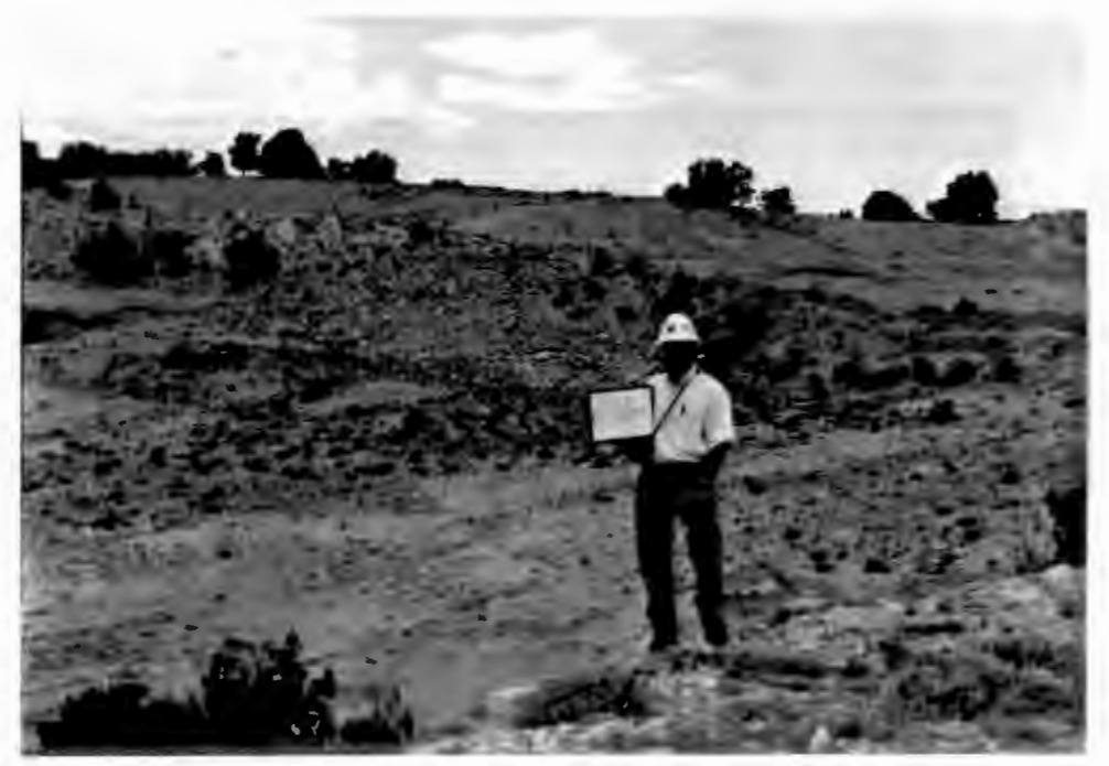
Section 31 T13N R9W, Northeast Side Looking West, 9/12/95