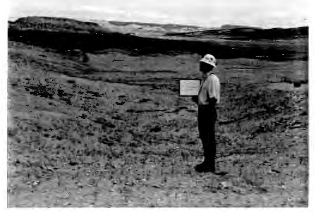
Section 31 T13N R9W, Southeast Side looking North