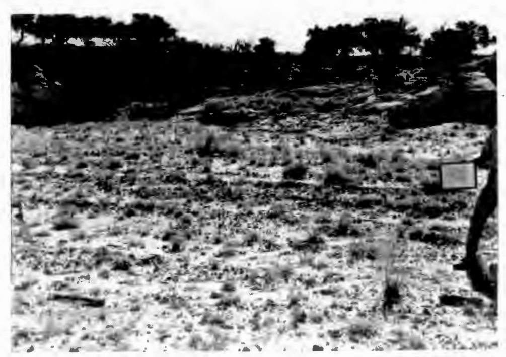
Section 1 T13N R9W, Shaft Site Looking West, 9/13/95