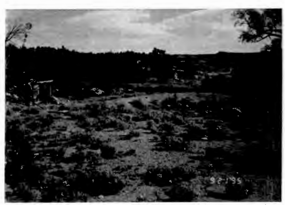
Section 13 T1N R6W, Powder Magzine, September 21, 1995