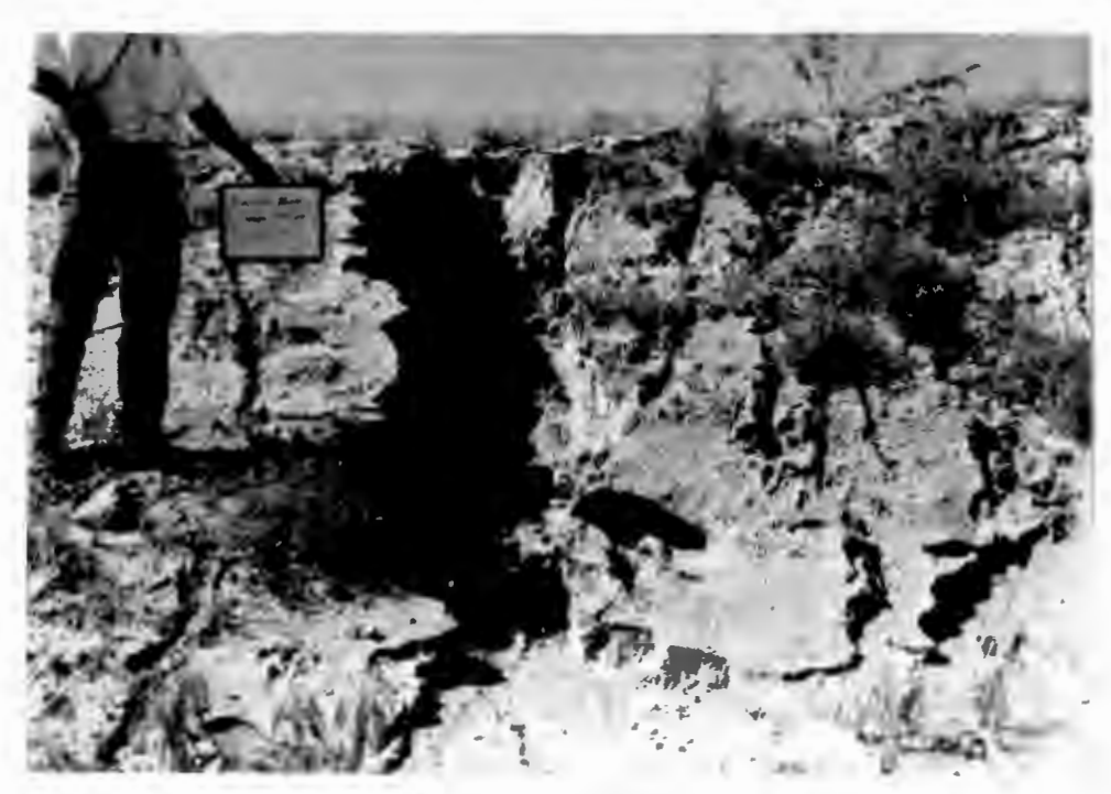
Isabella Mine, Erosion Feature, 9/12/95