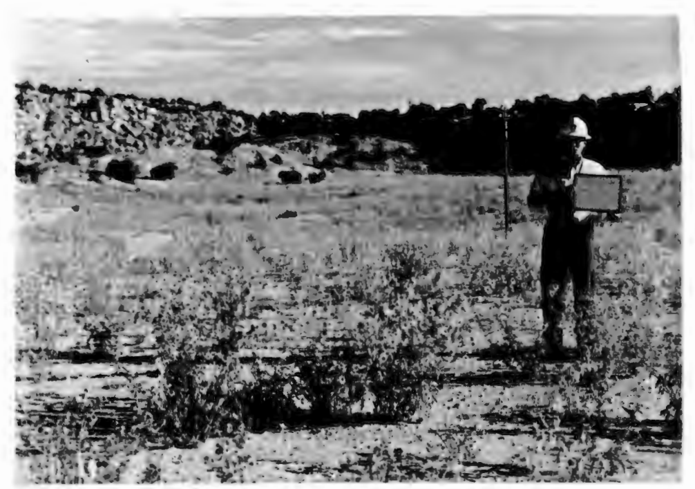
Poison Canyon Mine, Middle Looking North, 9/12/95