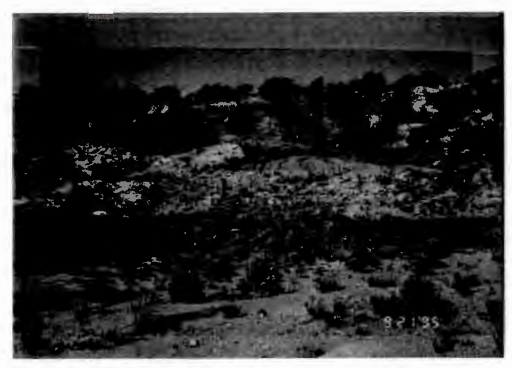
Section 13 T1N R6W, Mine Site from East, September 21, 1995