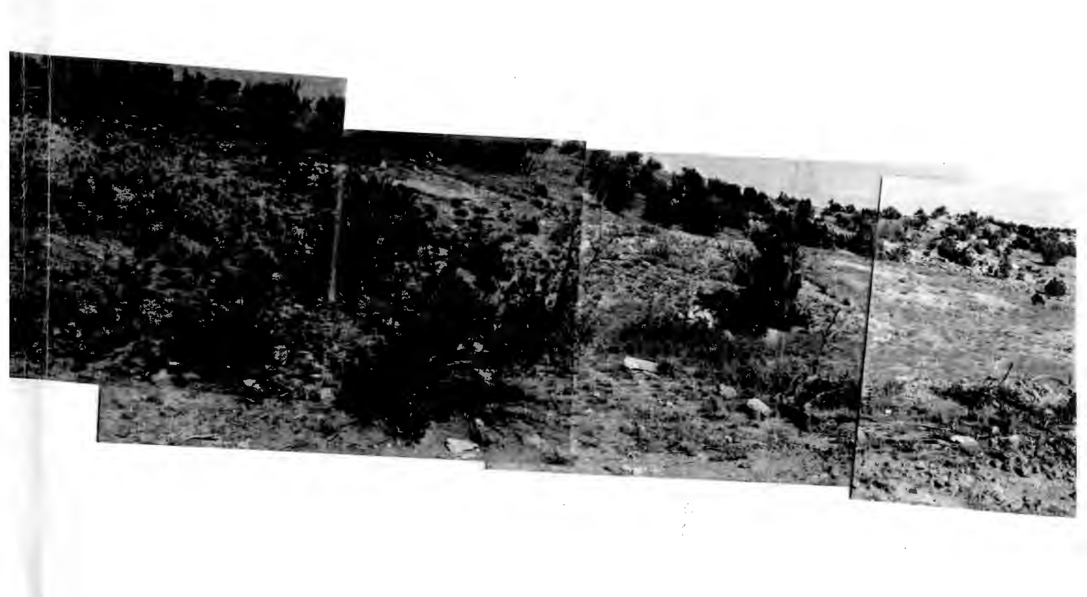
Section 13 T1N R6W, Mine Site From South