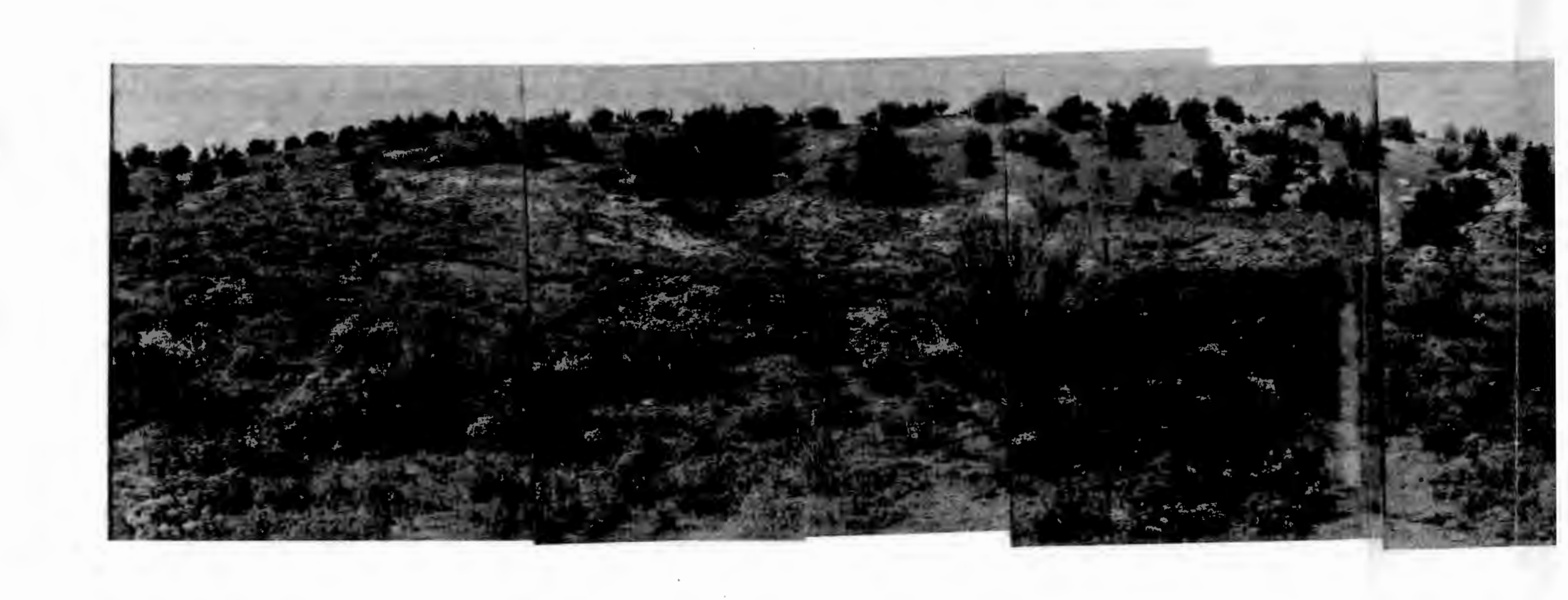
Section 13 T1N R6W, Mine Site From East