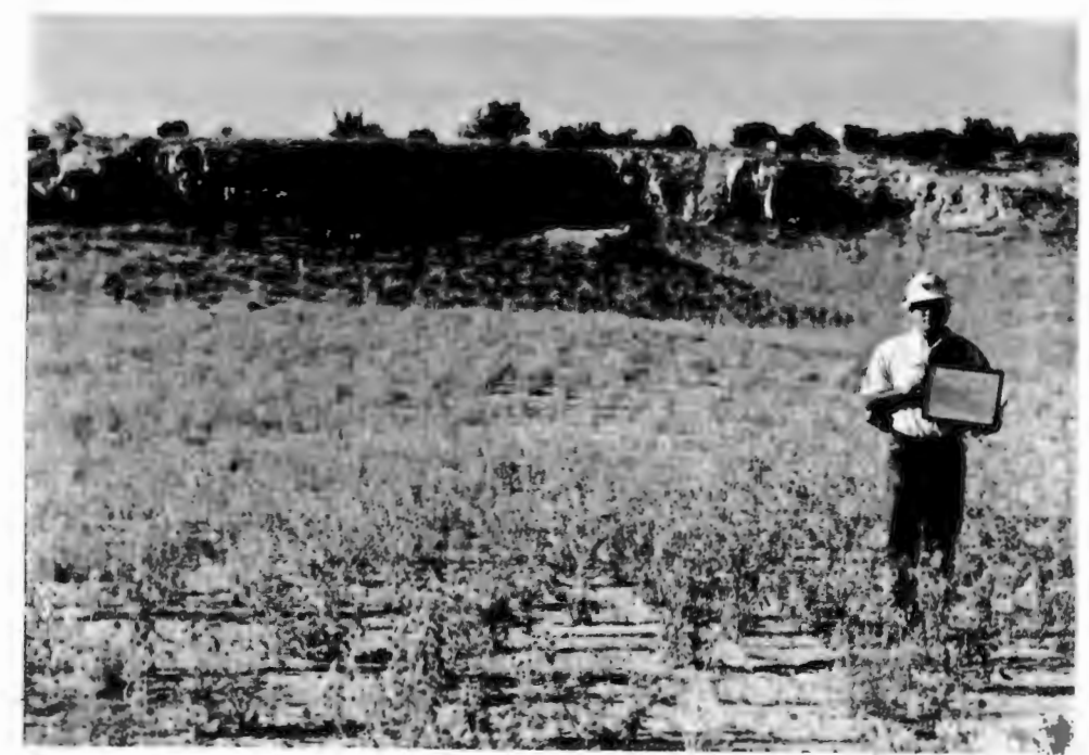
Poison Canyon Mine, Middle Looking South, 9/12/95