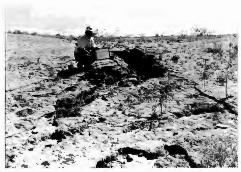
Section 25 Mine, Erosion Feature, 9/12/95