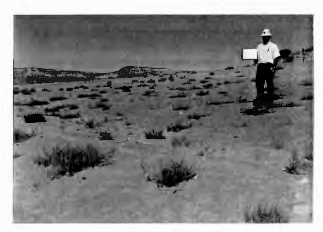
Marquez Mine, Waste Pile, 9/12/95