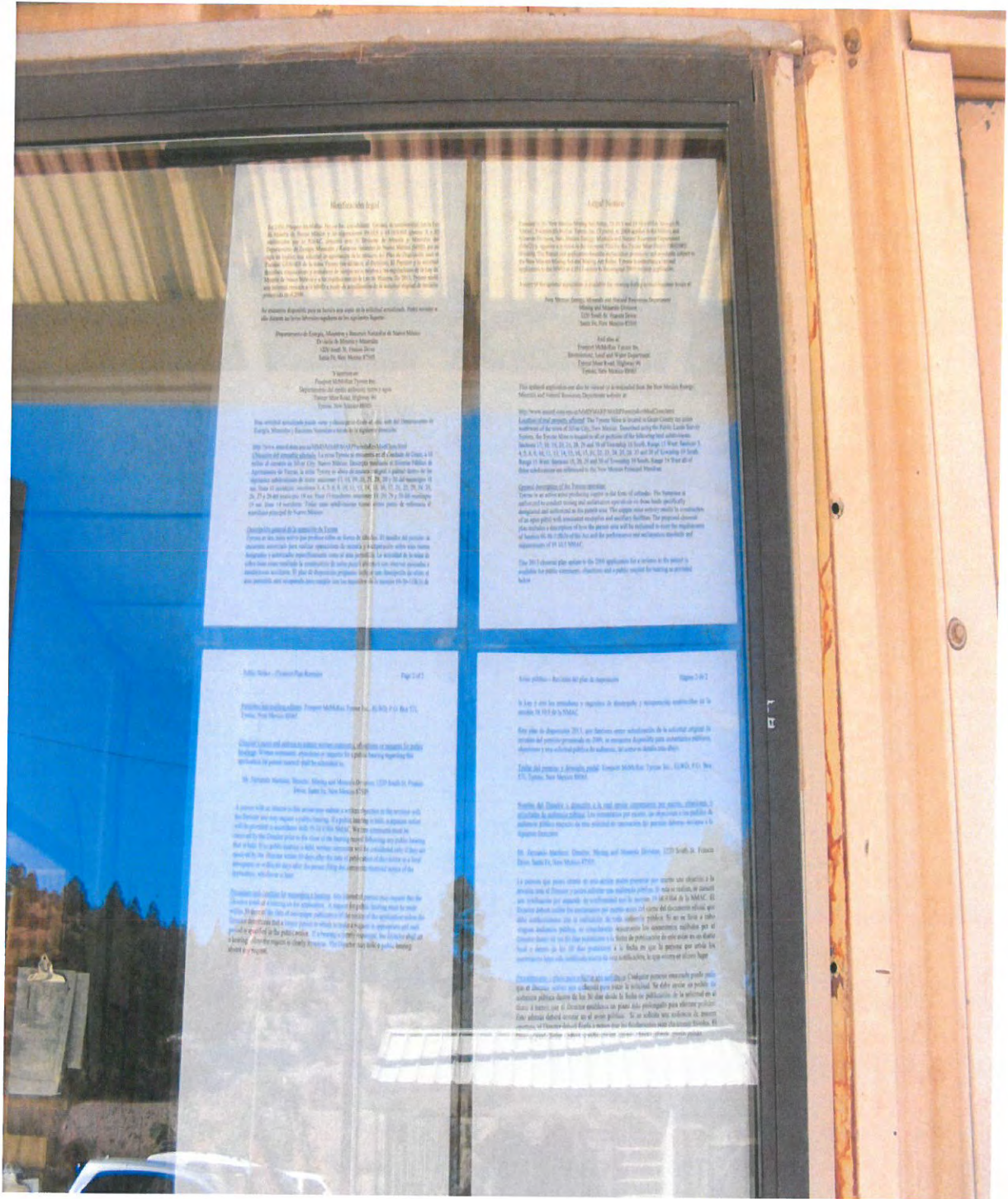
Public Notice Posted in English and Spanish at the Tyrone Security Gate