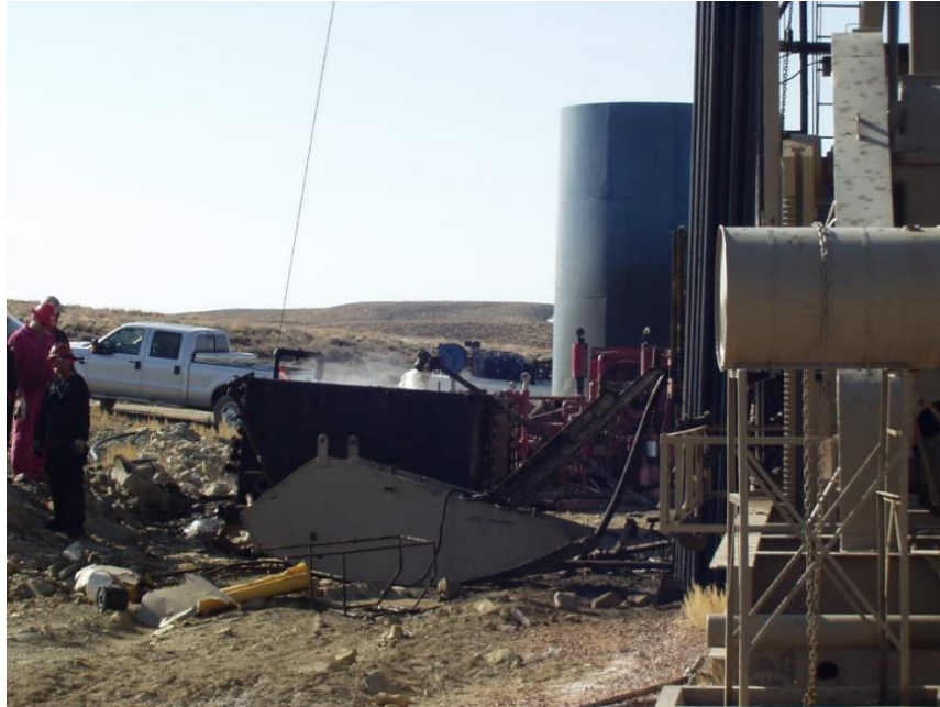
Exhibit A – Post Hydraulic Fracture Backflow to an Open Tank or Pit 15,16