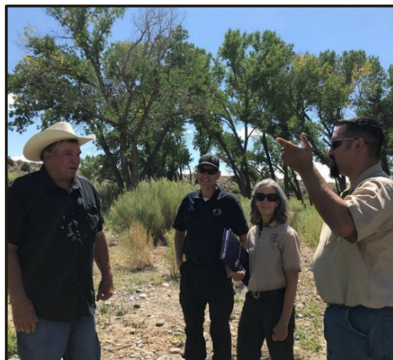
Staff managers from the San Juan Soil & Water Conservation District, San Juan County Fire, and NM Forestry Division discussing cottonwood bosque restoration along the San Juan River.