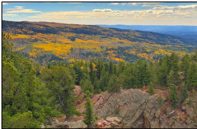
A view of aspens in the Brazos Cliffs area, which was recently protected in 2024 under the Forest Legacy Program