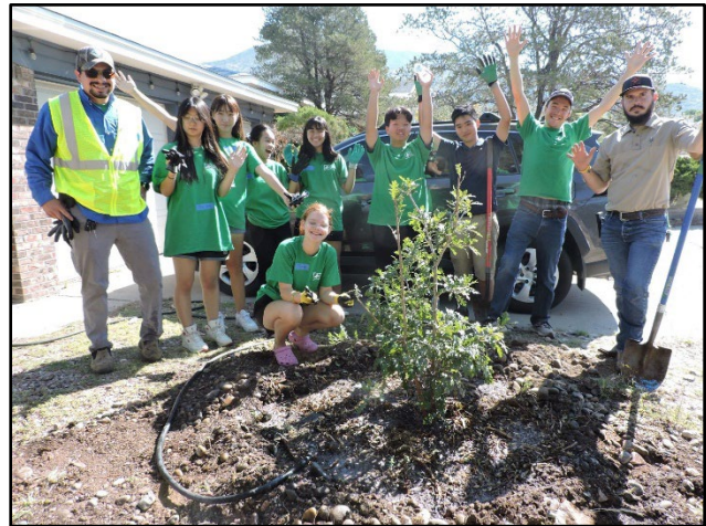
Staff from Socorro District and participants with Tree New Mexico celebrate an urban tree planting project.

Visit https://www.emnrd.nm.gov/sfd/forest-health/ for more information.