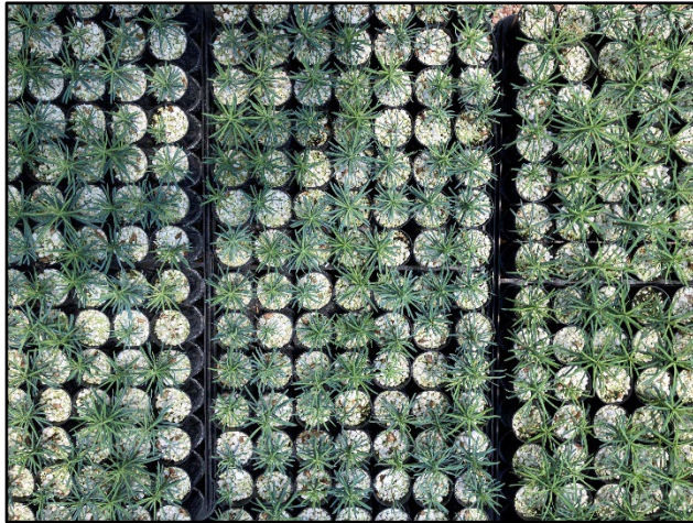
Seedlings available through the Division's Conservation Seedling Program.

Visit https://www.emnrd.nm.gov/sfd/carbon-sequestration-through-land-conservation/ for more information