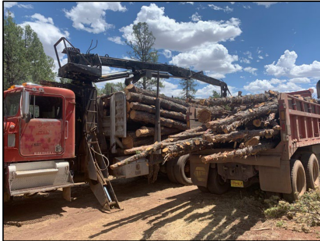
Logs collected from a Forest and Watershed Restoration Act Project