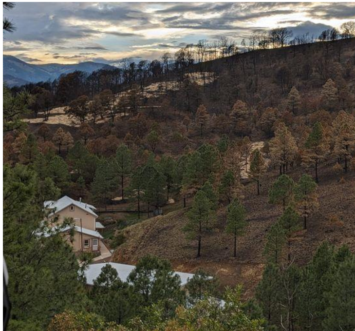
A home and landscape after the South Fork Fire in Ruidoso.

"New Mexico is no stranger to wildfire, but the increasing loss of homes is heart breaking," said State Forester Laura McCarthy . "Having 80% or more homes in a neighborhood meet the protection standards outlined in this bill will significantly reduce the risk of catastrophic loss."