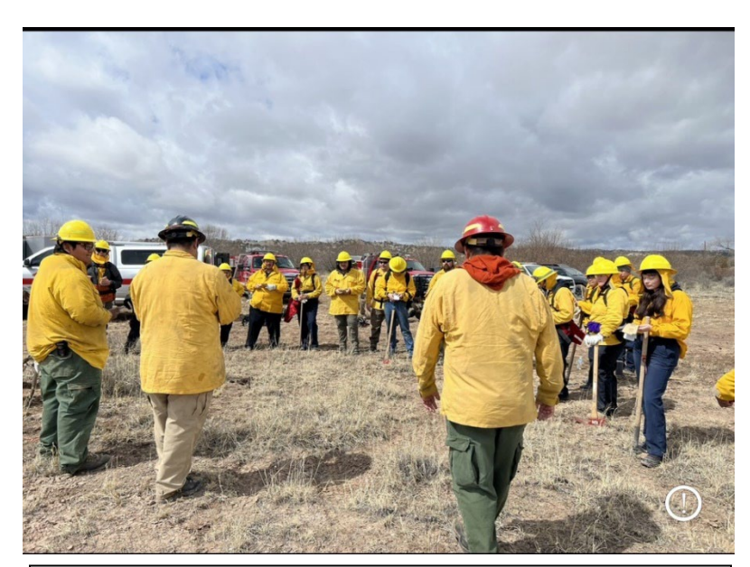
Cochiti VFD firefighters facilitating a After Action review (AAR) after assisting on Cochiti Pueblo's ag burn.

successfully treated for the growing season. In addition, 20+ firefighters and farmers received hands on training in a controlled environment. The success of this plan lays with the implementation of the CFD Wildland Coordinator. Cochiti firefighters participated in approximately 1500 hours of collective training in the 2023 season. This training was held not just in our stations but at different locations throughout the state.