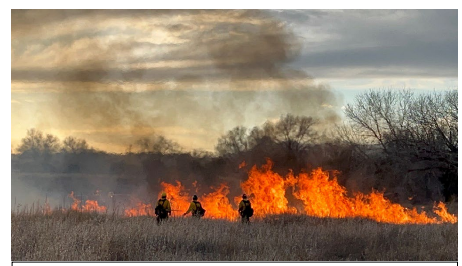
Cochiti VFD Bearhead Hand Crew assisting on a agricultural burn on Cochiti Pueblo.

In 2023, the Cochiti Wildfire Risk Reduction plan was implemented. The intent of this plan was to educate the public on safe practices during seasonal agricultural burns, provide firefighter training, and promote multi-agency cooperation. This program was deemed successful resulting in over 200 acres of agricultural fields safely and