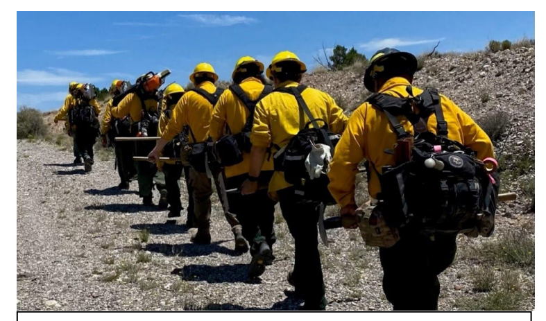
Cochiti Lake Fire Volunteer Department's Bearhead Hand Crew Module on a recent preseason training hike.

The VFA grant has been instrumental in creating a successful system by increasing out capacity within our region. This grant has helped the Cochiti Fire Department's Bearhead Fire Crew by providing much needed personal protective equipment, shelters, weather monitoring equipment, equipment handles, and fire hose. This equipment has helped us build capability by allowing us to provide for safety, not only to our