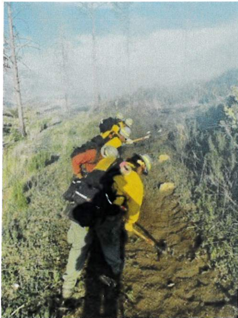
Allison Canyon Fire June 17, 2023

LCOES Wildland coordinator was able to use VFA acquired BK radios to effectively coordinate type 1 helicopter operations in the Alto group.