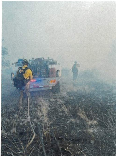
Cave creek Fire March 24, 2025 units from Bonito VFD LCOES, Lincoln VFD. Were able to suppress this incident quickly and effectively utilizing VFA acquired Equipment such as appliances, hoses, and PPE as well as communication equipment (BK Radios)