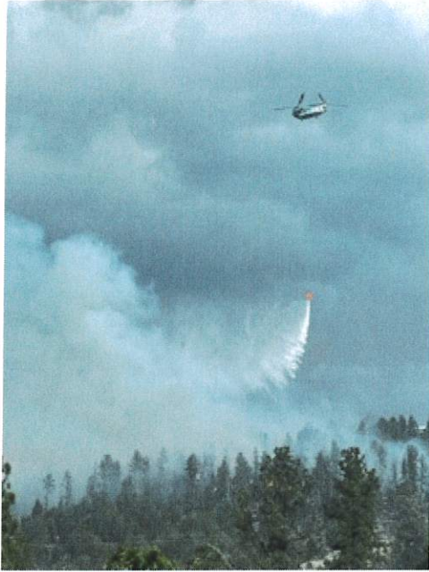
South Fork Fire June 2024

LCOES Wildland coordinator was able to use VFA acquired BK radios to effectively coordinate type 1 helicopter operations in the Alto group.