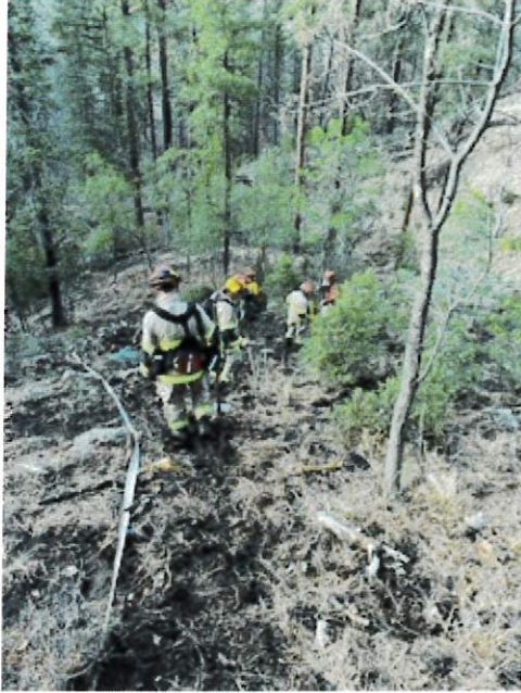
Flume Canyon incident May, 26 2025

Bonito VFD and LCOES with USFS and Ruidoso Fire department were able to lay a hose line with new Hose acquired by VFD funds and wear new PPE and use new Hand tools. This fire was brought under control very quickly with all resources utilizing great communication and updated equipment