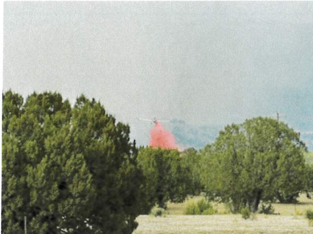
Camp Fire May, 25 2025

Bonito VFD and LCOES with USFS and Ruidoso Fire department were able to lay a hose line with new Hose acquired by VFD funds and wear new PPE and use new Hand tools. This fire was brought under control very quickly with all resources utilizing great communication and updated equipment