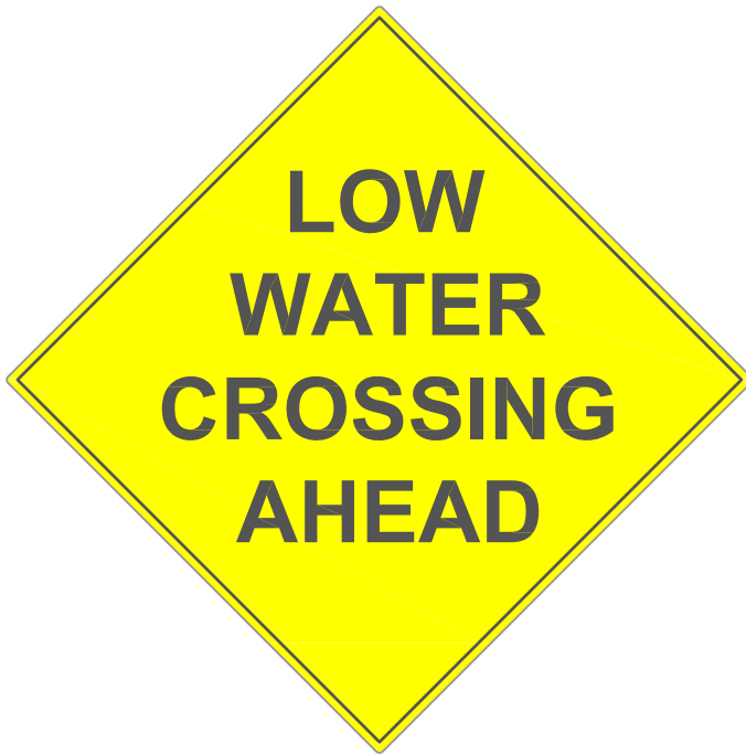
SIGN 1 SCALE: 1" = 1'-0"