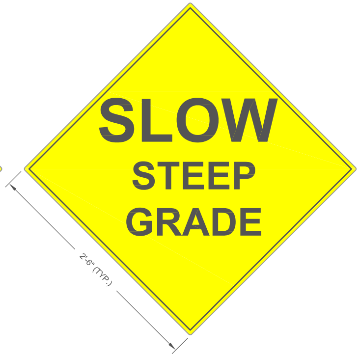
SIGNS 2 & 3 SCALE: 1" = 1'-0"