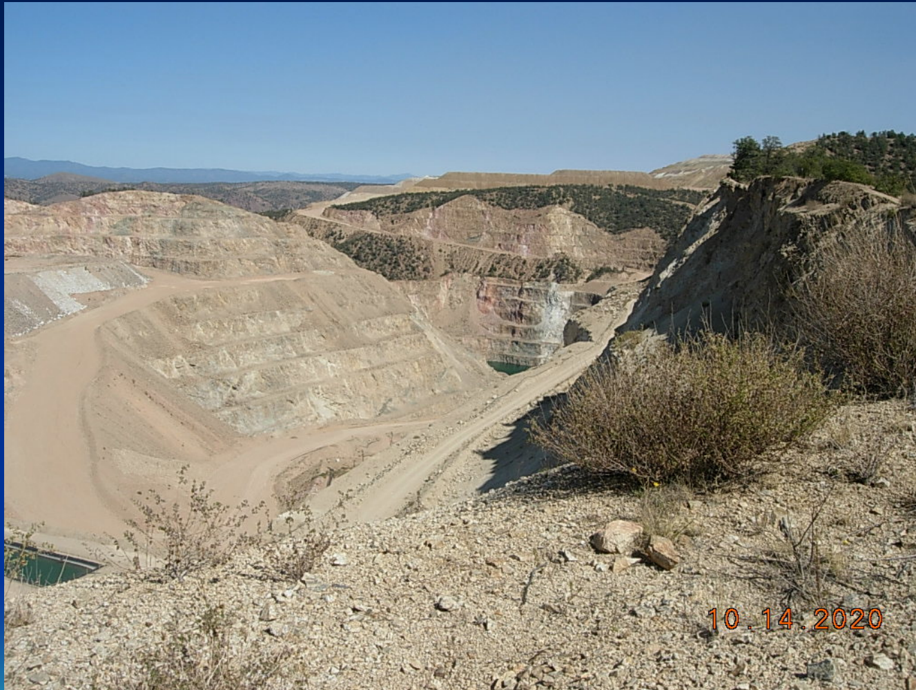
Little Rock Mine Open Pit looking east from the Open Pit Crest near the Copper Leach Stockpile (10/14/2020)