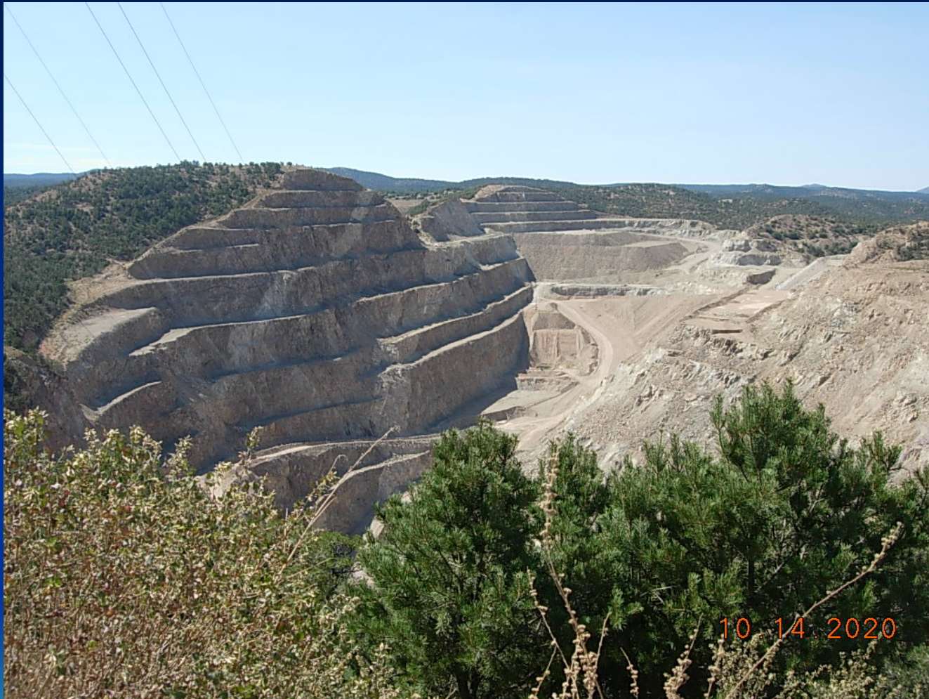
Little Rock Mine Open Pit looking west from the Tyrone Mine Overlook (10/14/2020)