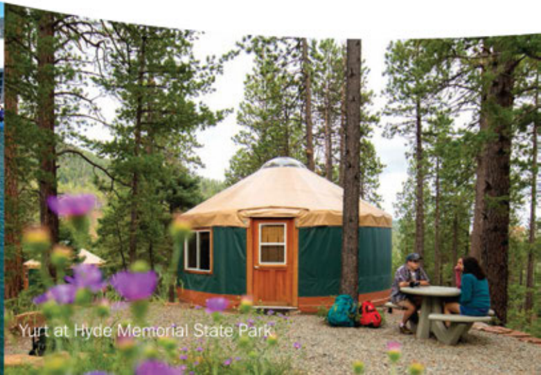
Yurt at Hyde Memorial State Park