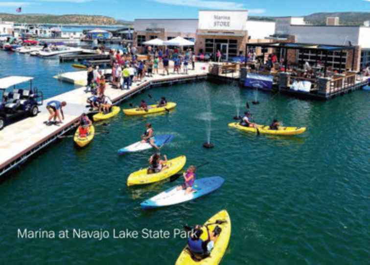
Marina at Navajo Lake State Park

The Jemez Mountains provide the backdrop for Fenton Lake State Park. The park is surrounded by ponderosa pine forests that attract campers, hikers, and cross-country skiers.