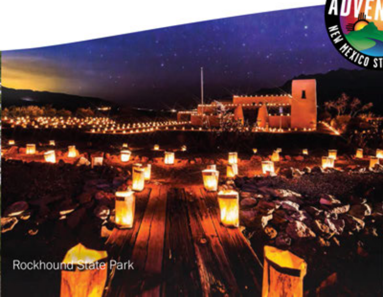
Rockhound State Park